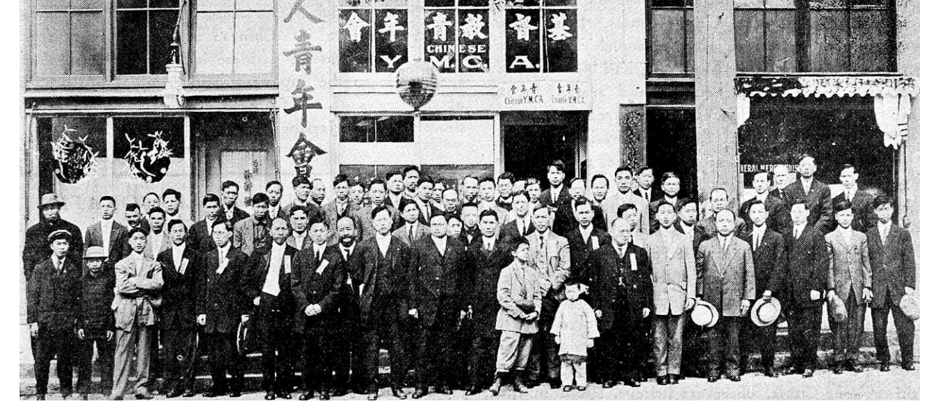
1912 After months of holding programs in churches, the Chinese YMCA opens its first building. (CHSA, Chinese Digest, Edward Wing Tom Collection, gift of Luella Mak)

In 1910 the Angel Island Immigration Station opens, replacing the previous detention site—a shed at the Pacific Mail docks—with a new facility for examining and detaining incoming passengers of Chinese descent. The pre-quake practice of attempting to bar Chinese and Chinese Americans with legitimate rights to entry continues, as does the practice of writing poems of lamentation and protest on the walls. In 1913, California deprives Chinese and Japanese immigrants of the right to buy land.