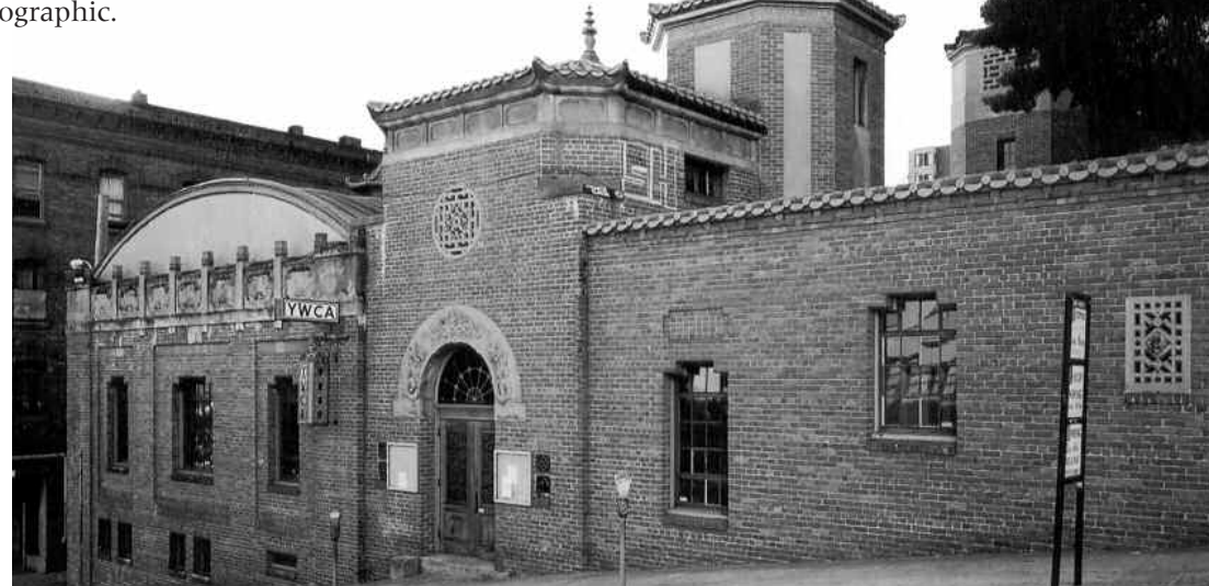
In 1932, the Chinese YWCA opened its new Julia Morgan-designed facility. CHSA renovated and now preserves the building as its museum and learning center. The communityfocused spirit lives on in today's CHSA.

2006—one hundred years after the post-earthquake fire leveled San Francisco Chinatown, Chinese Americans are San Francisco's largest ethnic population, and newly arrived Chinese form the city's fastest growing demographic.