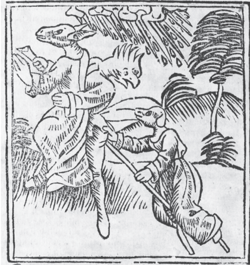
Auct. 4Q 5.30, fol. a3v, Ulricus Molitoris, De lamiis et phitonicis mulieribus. http://bit.ly/1KsoN4S .