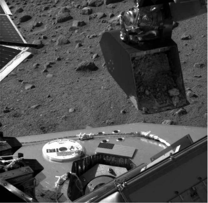
Figure Epilogue.1. NASA's Phoenix Mars Lander poised to deposit a soil sample into one of its ovens, where samples were heated to determine their chemical composition.

embedded within those signals. We could know that extraterrestrials are out there but have no direct way of knowing much about them.