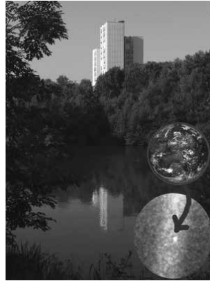
Figure Introduction.1. This Earth Speaks message puts the sender’s location—the town of Les Ulis, France—in broader geographical and astronomical contexts.

After speculating on the physical environments in which extraterrestrial intelligence might evolve, Edmondson concludes that the factors affecting the propagation of sounds could vary so much from planet to planet as to make audition an unlikely universal. Instead, he argues for messages based on vision, a position that has long been advocated within the SETI community, albeit not without opposition. 13 As one example of a visual message, Edmondson suggests sending a “Postcard Earth,” a grid-like collage of color snapshots showing multiple scenes of our world and its inhabitants. Interestingly, several individuals have independently submitted this same type of message to the SETI Institute’s online project Earth Speaks , in which people from around the world are invited to propose their own messages for first contact with an extraterrestrial civilization. One pictorial message, sent from a participant in Les Ulis, France, shows buildings by a lake in that city, with inset views showing the location of Les Ulis on a map of Earth and then Earth’s location in a broader galactic context (see Figure Introduction.1). This proposal from Earth Speaks is reminiscent of Edmondson’s idea that a technologically advanced civilization may be able