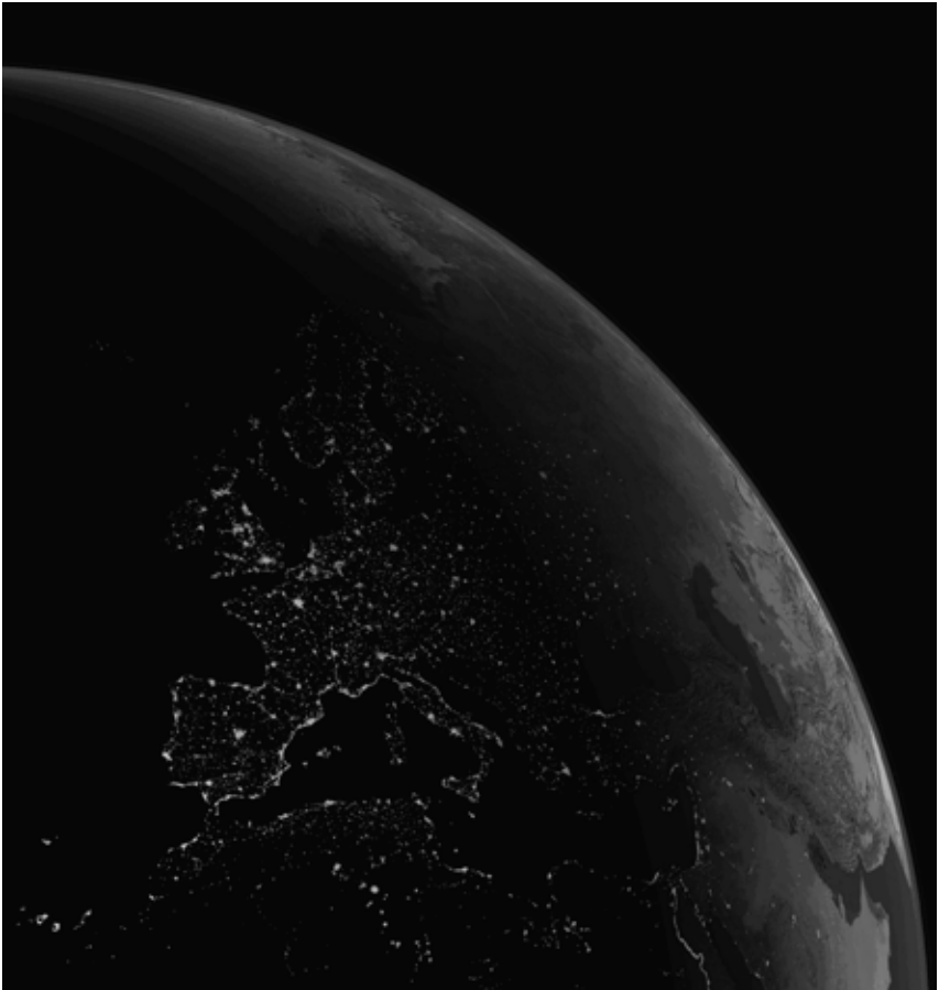
Figure 15.3. As this composite image of Earth at night suggests, our planet's emitted light could serve as a biomarker for extraterrestrial intelligence. The image was assembled from data collected by the Suomi National Polar-orbiting Partnership satellite in April 2012 and October 2012.

able to accomplish from perhaps as far as 100 parsecs away from us, assuming good weather on Earth.