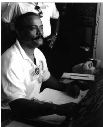
Figure 2.1. High-Resolution Microwave Survey observations begin on 12 October 1992.

likely to worsen, so there was an impetus to start full-fledged “listening” quickly.