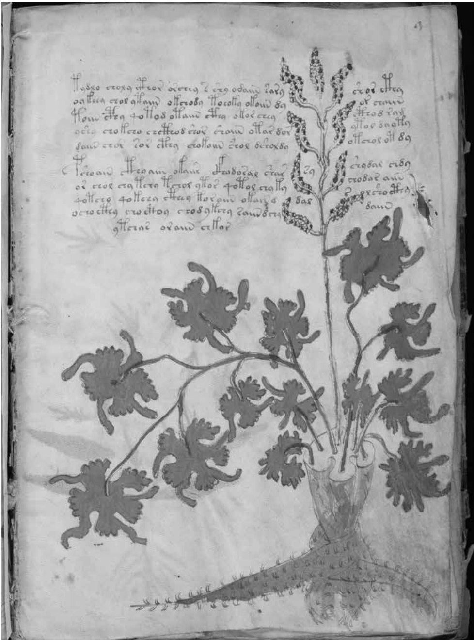
Figure 15.2. The Voynich Manuscript ( Beinecke MS 408 ), fol. 9, General Collection, Beinecke Rare Book and Manuscript Library, Yale University, New Haven, Connecticut.