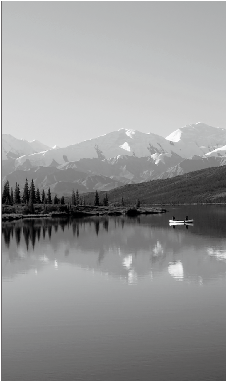
DENALI NATIONAL PARK AND PRESERVE / TREY SIMMONS