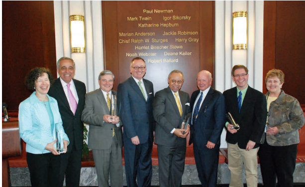
2010 Induction Ceremony