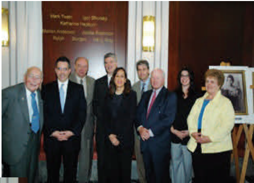
2008 Induction Ceremony