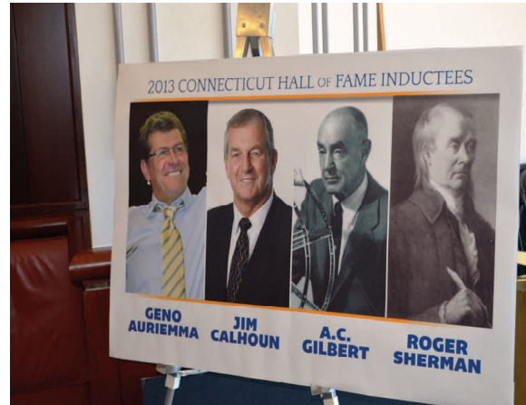
2013 Connecticut Hall of Fame Inductees