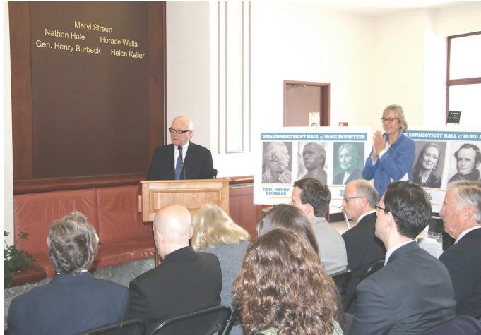
Sen. Crisco and Rep. Wood and 2016 ceremony attendees