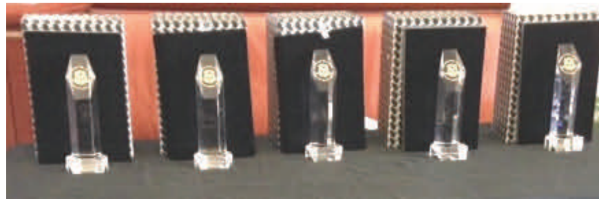
Awards for 2016 Inductees