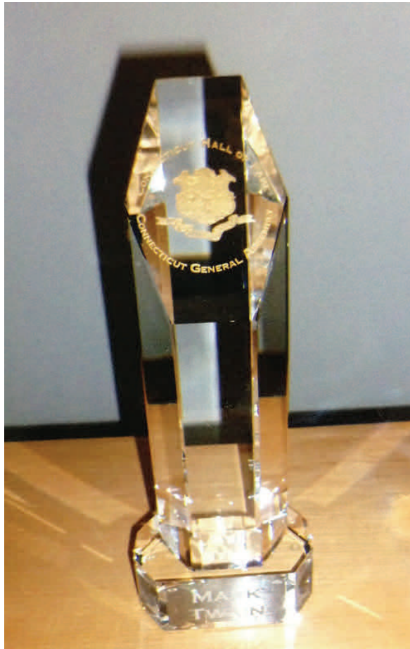
The Connecticut Hall of Fame Award