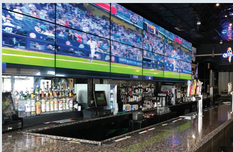
Food and Beverage