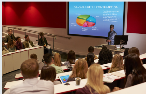
Education / Houses of Worship