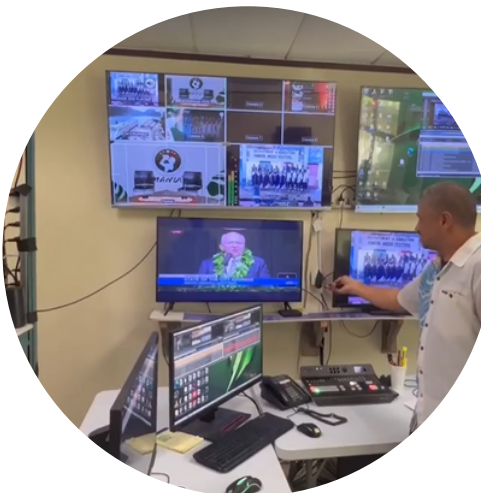
Deputy Laupola reviewing the digital broadcast playout.