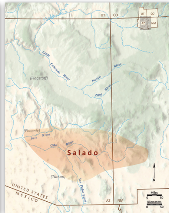
Main area of Salado influence, 1300–1450

The overall style originated with the Kayenta. It changed as the communities in which they had settled adopted and used it. Some of the imagery reflects widespread Mesoamerican motifs that would have been familiar to local and immigrant groups. Depictions of serpents, lightning, and clouds evoked rain and fertility. We believe these powerful symbols were an important part of the new ideology, helping to unite people of different heritage.