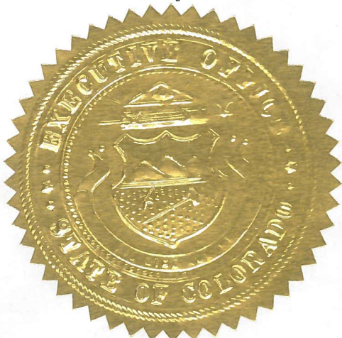
Jared Polis Governor

A handwritten signature in black ink that reads "Jared Polis".