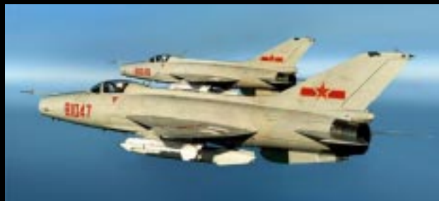
The J-7E and G variants use new avionics and a new double delta wing.