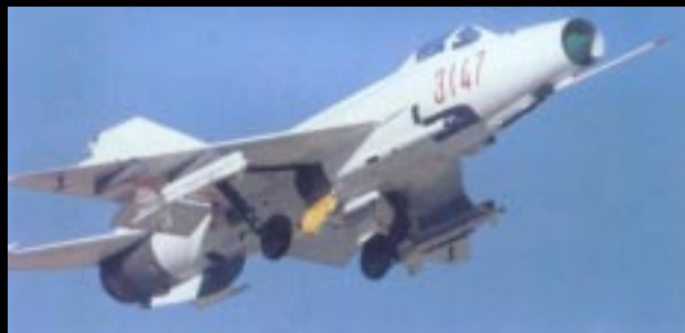
The J-7-II is equivalent to later Russian MiG-21s.

The initial batch of Su-30MKs has been put at 38 to 50 aircraft for the PLA-AF, with the PLA-N now opting for the 'maritime' Su-30MK2 with avionics changes for the role. Available photographs and press reports indicate that the Kh-59 Kazoo has been acquired, in electro optic/datalink guided and radar guided anti-ship variants, as well as the Kh-31R anti-radiation missile and the Kh-31A anti-shiping missile – the Kh-31 is likely to be licence built now. The KAB-1500 and KAB-500 guided bombs have also been supplied.