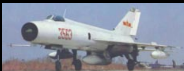
The J-8R is a tactical recce variant of the early J-8-I, with podded sensors.