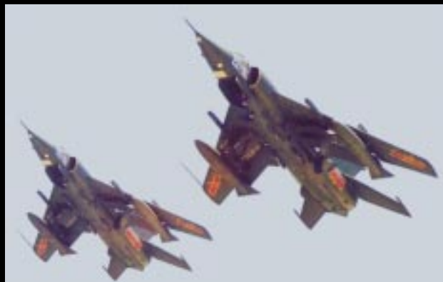
The Q-5/A-5 series are a significant evolution of the F-6/MiG-19 family, filling the A-4 Skyhawk niche.