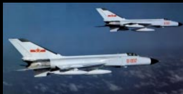
The large twin engine Finback is used mostly as an interceptor, this is a unique design derived from MiG-21 technology but twice the size.