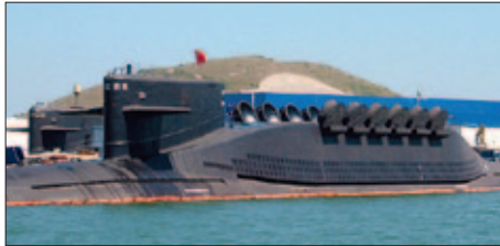
New Type 094 Jin SSBN with missile tube doors open.