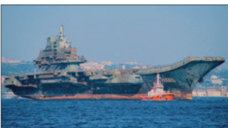
US Navy image of the derelict Varyag being towed through the Bosphorus in 2001, ostensibly to become a floating casino in Macau.

As China's submarine fleet recapitalisation effort progresses, it will have the largest fleet of modern boats in the Pacific, other than that of the US Navy. This will inevitably impact the strategic balance across the Western Pacific, but in time likely also the Indian Ocean.