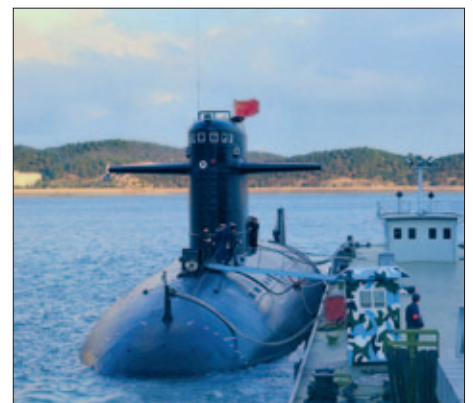
The Type 091 Han class was China's first SSN, and is now being replaced.