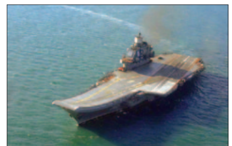
Varyag sea trials in August, 2011.