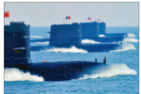
The Type 039/039G Song is competitive against the imported Russian Kilo SSKs.