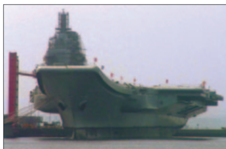
Varyag at Dalian being refitted in 2009-2010.