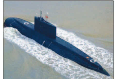
Item 636 Kilo class SSK of the PLAN.