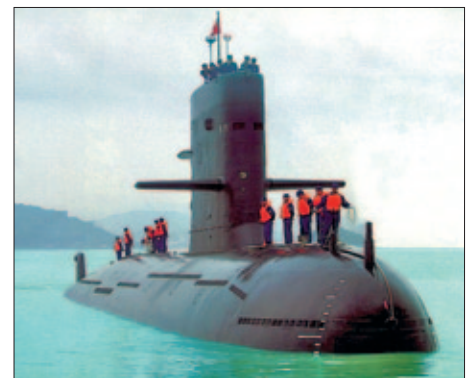
The Type 039A/B or Type 41 Yuan class are successors to the Song SSK. Later boats have an enlarged fin, and retractable bow planes. The class is credited with a Stirling engine AIP system.