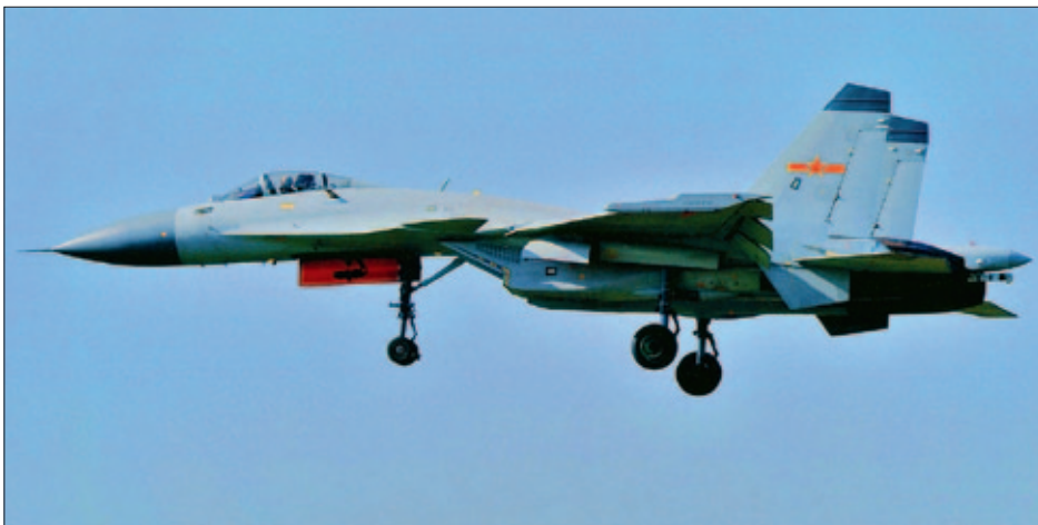
The J-15 Flanker D is a reverse engineered Russian Su-27K/Su-33, likely using Chinese systems developed for the J-11B Flanker.

There are numerous reports on PLAN work to develop and construct additional carriers, and claims these would use nuclear propulsion. At present detail is insufficient to form strong conclusions. It is likely that any indigenous carrier would be based largely on the Item 1143.5, as this