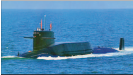
Only a single Type 092 Xia class SSBN was ever built.