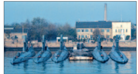
Type 035 Ming SSKs during the 1980s.

The Chinese built Type 039/039G/039G1 Song SSK achieved IOC in 1999 and remains on offer for export, with 12 to 16 boats claimed to be operational. This is a modern quiet SSK, clad with anechoic tiles, with six 533 mm bow tubes and powered by three licenced German MTU 16V396SE84 diesel engines, with an electrically driven seven-blade low noise screw. An active/passive bow sonar is supplemented by a flank mounted low frequency passive sonar, both claimed to be based on Thales sonar equipment. Up to 18 x 533 mm weapons can be carried, typically a mix of Yu-3 and Yu-4 electrically powered homing torpedoes, and encapsulated YJ-82 / CSS-N-8 Saccade ASCMs, which are