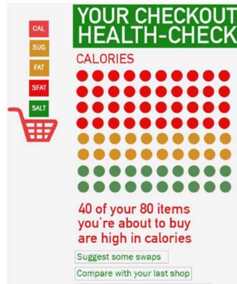
Fig. 3. A proposal for an optional pop-up health-check at the checkout (40) .

Provision of standardised nutrition information on food packaging is now a legal requirement and therefore a high degree of consistency now exists on the physical