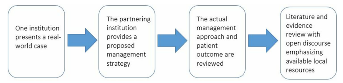
Figure 2. Cardiology across continents session format.

participation and global representation grows, the addition of participant surveys and clinical vignettes can also provide more objective data regarding practice variation across different settings. Additionally, we envisage "Cardiology Across Continents" evolving into collaborative written product with presentations forming the basis for Case Reports or practice reviews and providing an opportunity for trainees to contribute for publication in Cardiology in the Young.