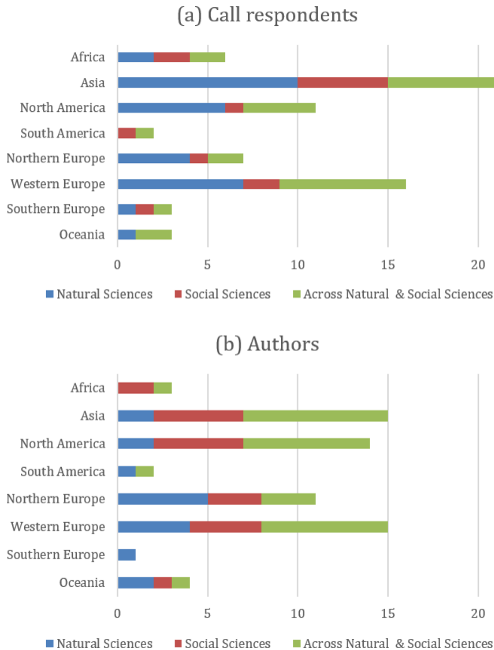
Figure 1. Classification of (a) call respondents and (b) authors (including invited experts, coordinating authors and editorial-board members) in terms of scientific discipline and geography (affiliation based, for details about the geography definitions, see the Supplementary material). Gender composition among call respondents was 30/37/2 (female/male/prefer not to say); among authors it was 33/32/0. The call respondents' classification was made based on their responses; the authors' classification was individually confirmed.

publication dates between January 2021 and July 2022; and (2) individual input from expert and coordinating authors.