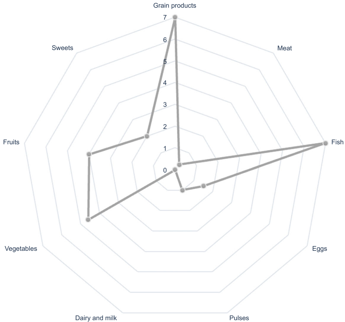
Fig. 2 Average weekly frequency of consumption of 9 different food groups, derived from the 10 categories of the MDD-W

though the category of vegetables is reported to be consumed daily by 71.9% of the population. Failure to meet RDAs of calcium, iron and zinc, must be highlighted, considering their centrality covered by those micronutrients in the correct development of the foetus and the state of maternal health. This could be due to the rare consumption of milk, dairy products, legumes, meat and poultry.