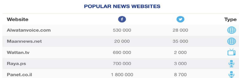
Figure 4: The most popular news, according to CFI Media Development (2015): 42

The most popular news websites, including of radio and TV outlets, are listed below (date 2015).