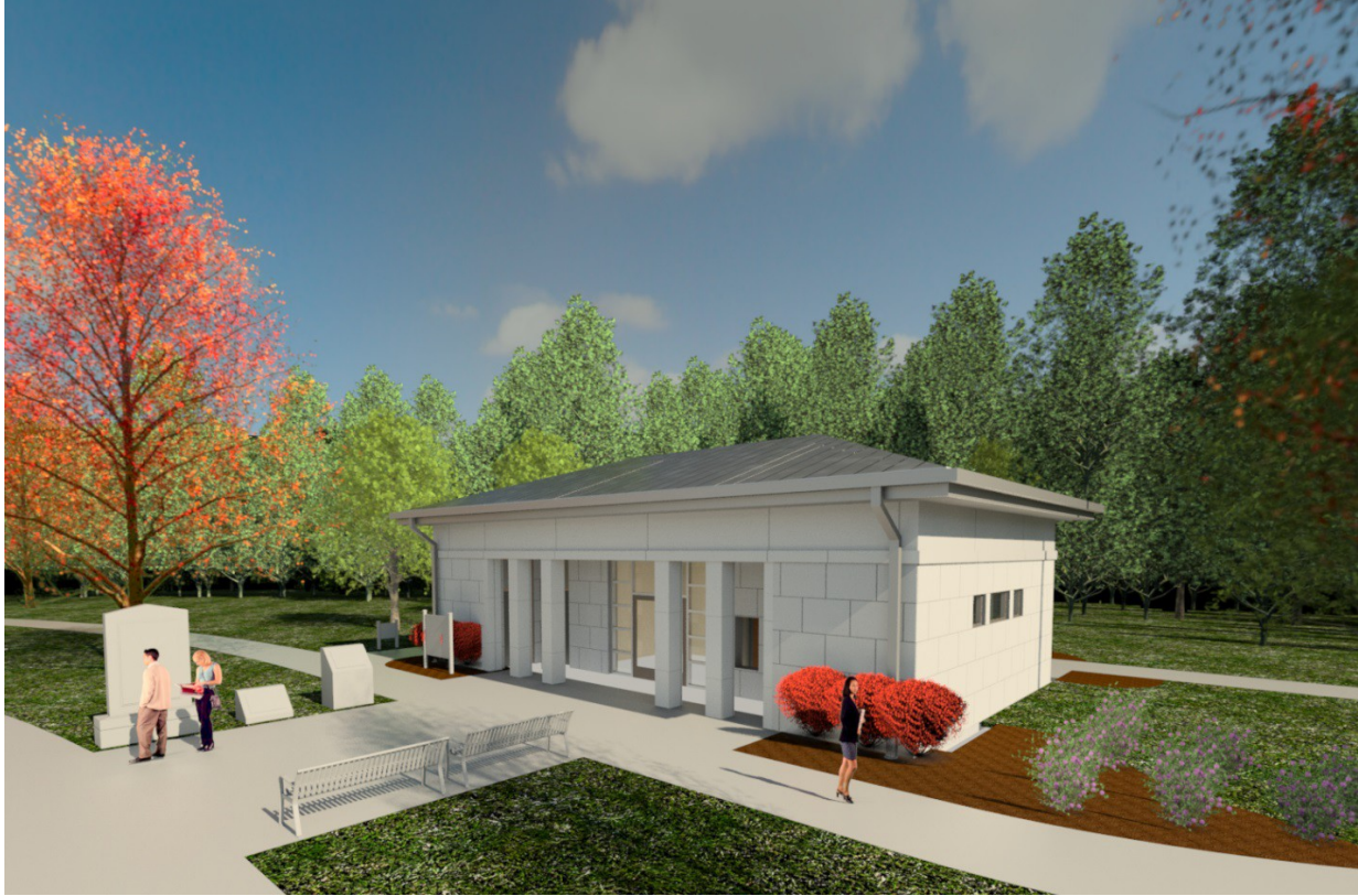
Photograph 8 - Typical View of Public Information Center with Restrooms