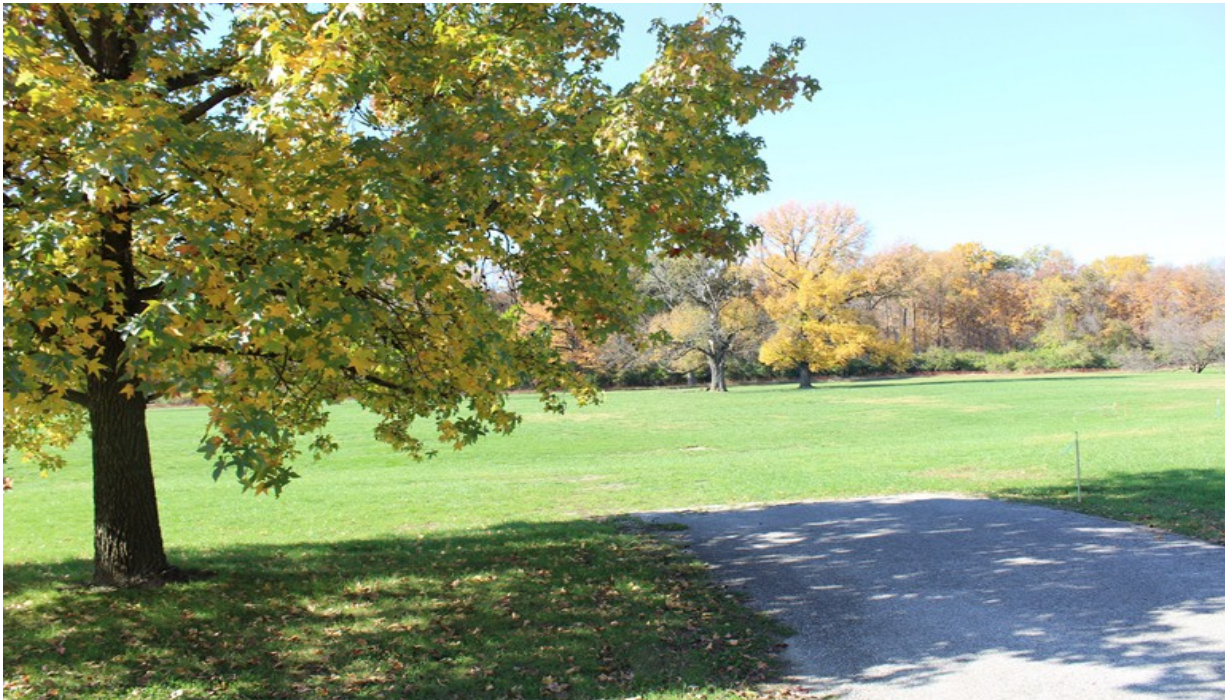
Photograph 6 - Crown Hill Land Parcel view from Clarendon Rd