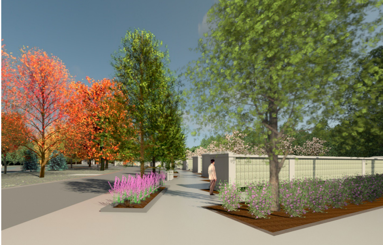
Photograph 10 - Typical View of a Columbarium