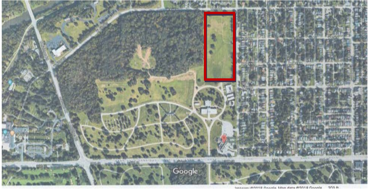
Photograph 3 - Satellite view of Crown Hill Cemetery - Purple Box shows Acquisition Parcel on Satellite View