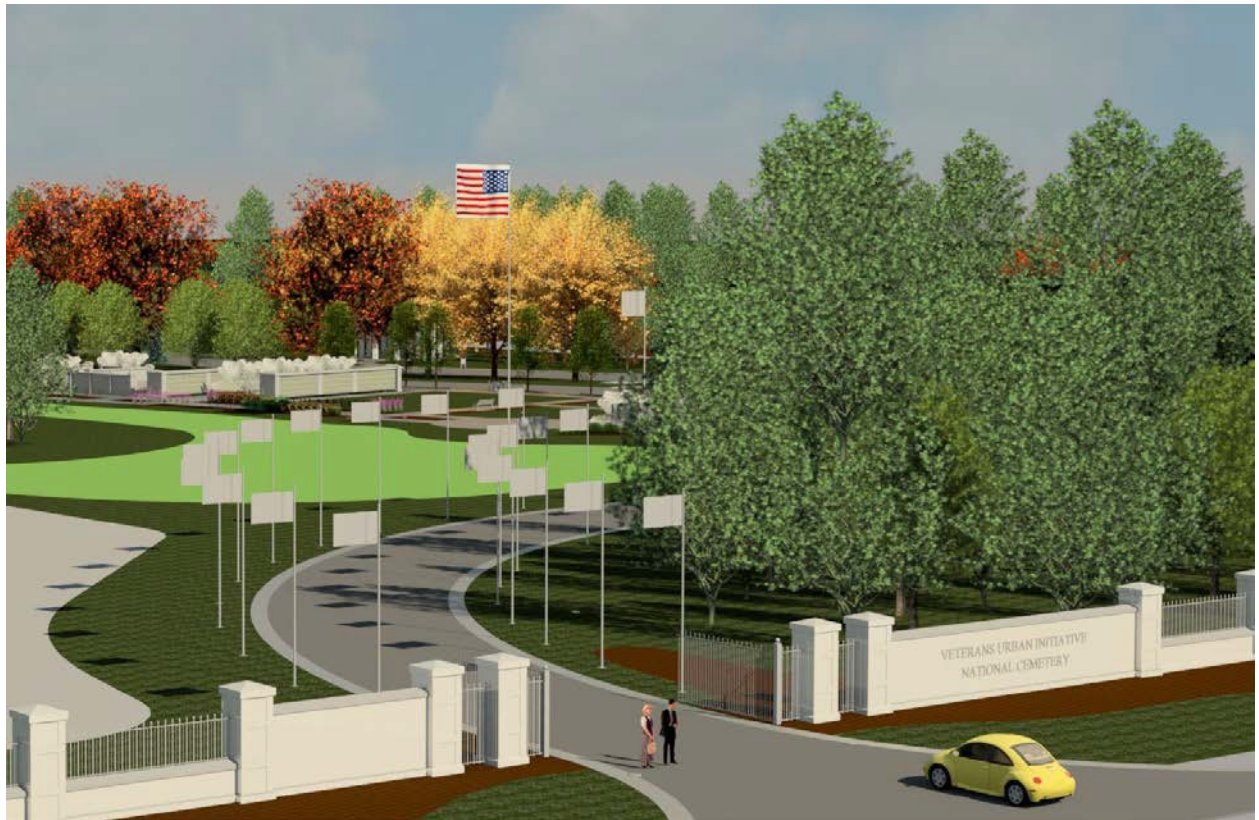
Photograph 7 - Typical Entrance View of Front Gate