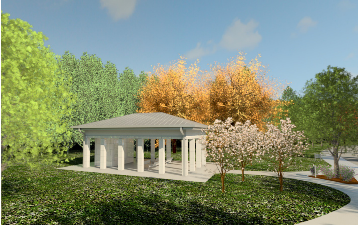
Photograph 9 - Typical view of a Committal Shelter