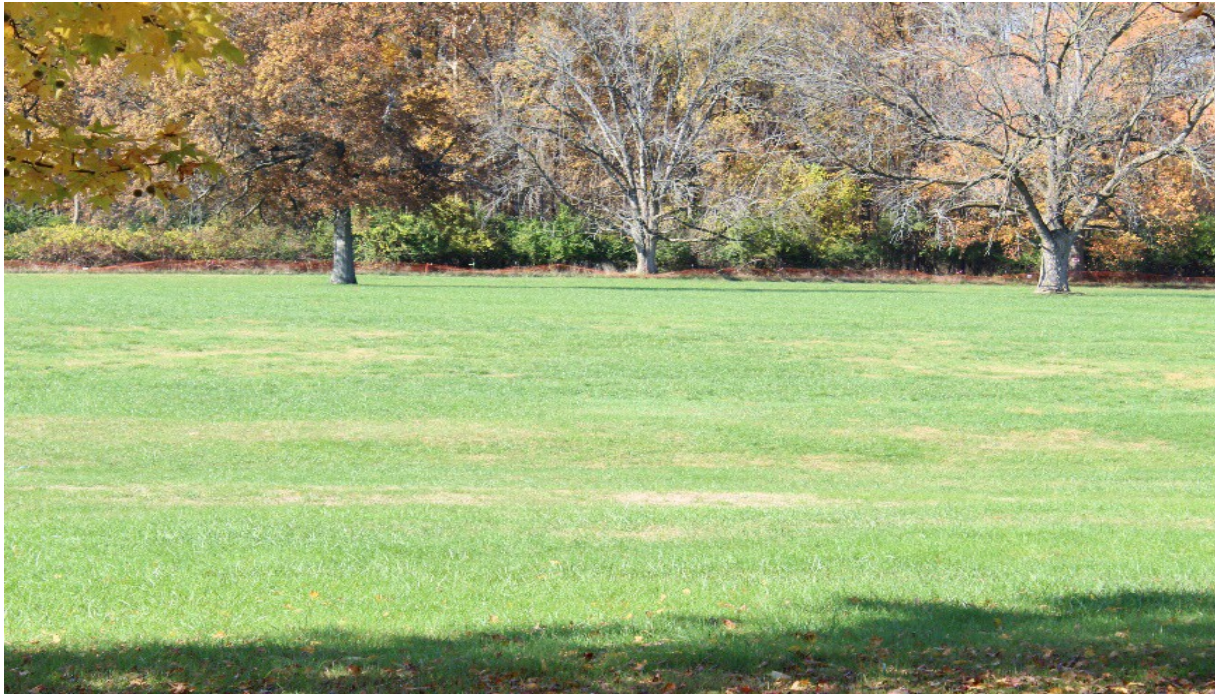
Photograph 5 - Crown Hill Land Parcel view from Clarendon Rd