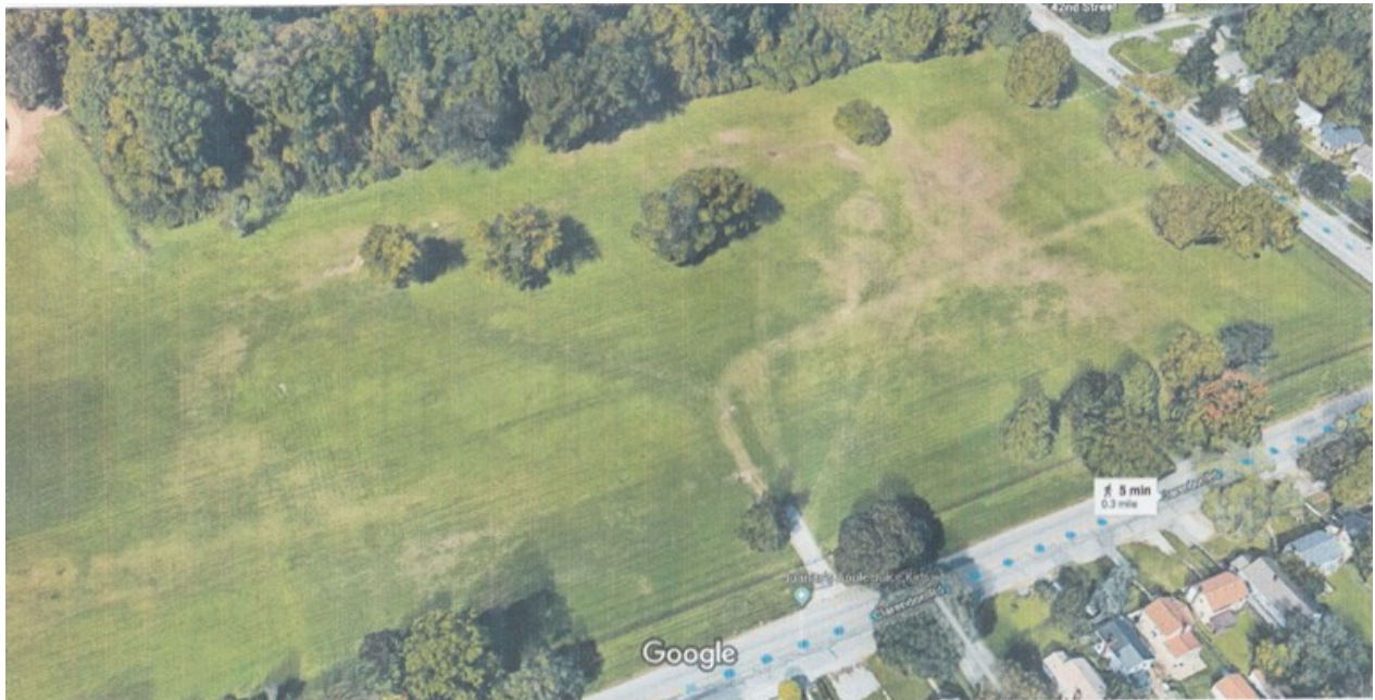
Photograph 4 - Birds eye view of Land Parcel