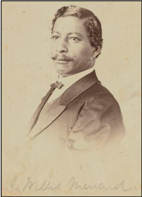
Library of Congress.

Newspaperman, Politician, and Census Clerk