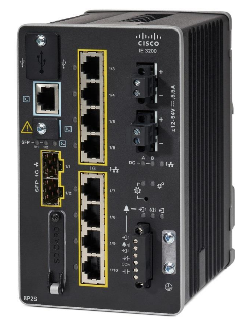
Figure 1. Cisco Catalyst IE3200 Rugged Series