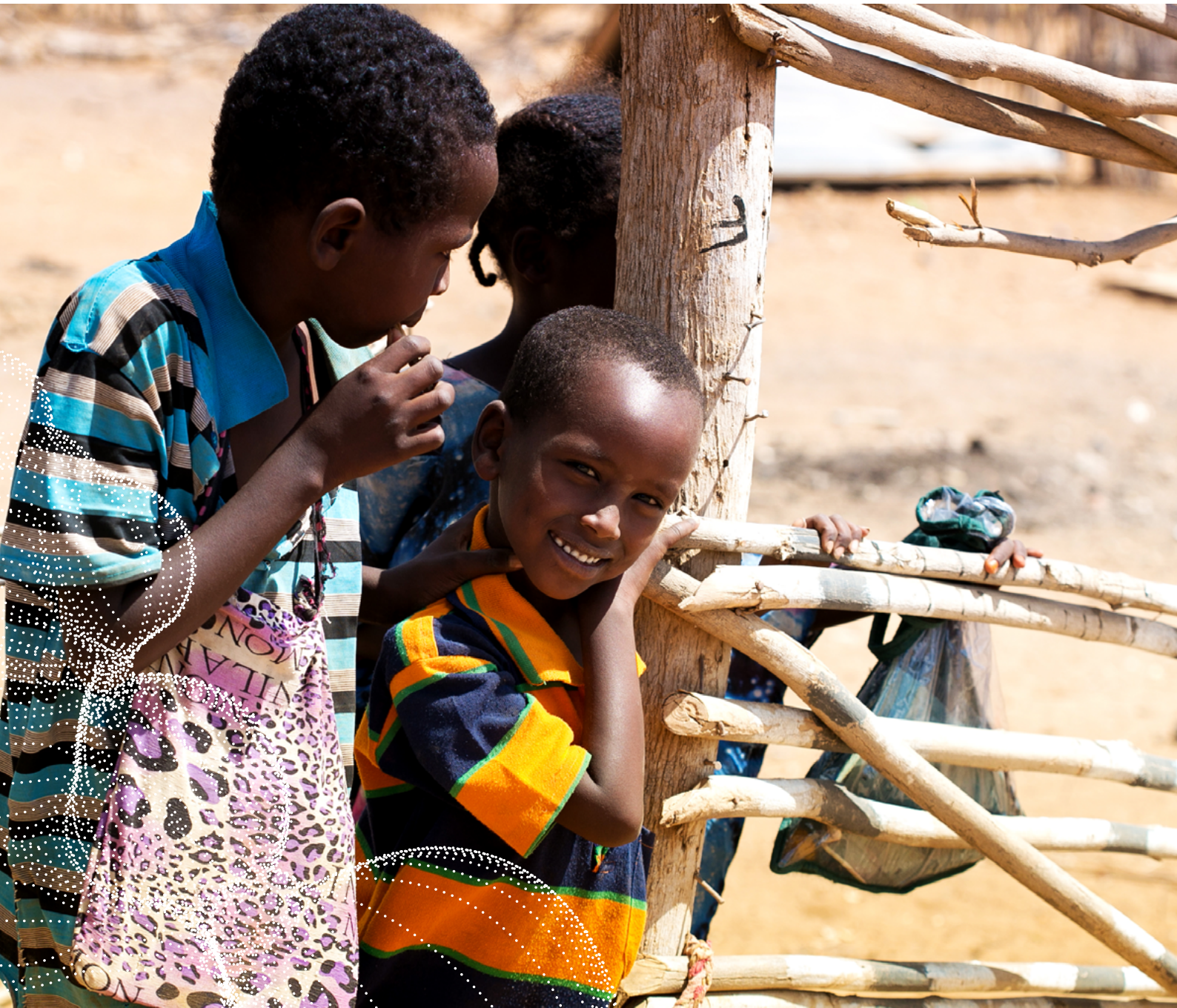
Photo: Two children in Ewaso Ng'iro river basin in central Kenya.