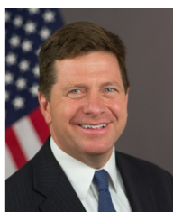
FIRESIDE CHAT MODERATOR JAY CLAYTON CHAIRMAN OF THE SECURITIES AND EXCHANGE COMMISSION