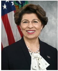
KEYNOTE SPEAKER JOVITA CARRANZA 44TH TREASURER OF THE UNITED STATES

Treasurer of the United States Jovita Carranza serves as a principal advisor to Secretary Mnuchin. Her focus is to increase participation in our vibrant economy by fostering financial capability and sustainability. Consistent with Treasury's mission to maintain a strong economy, foster economic growth, and promote prosperity and stability Treasurer Carranza oversees the Office of Consumer Policy