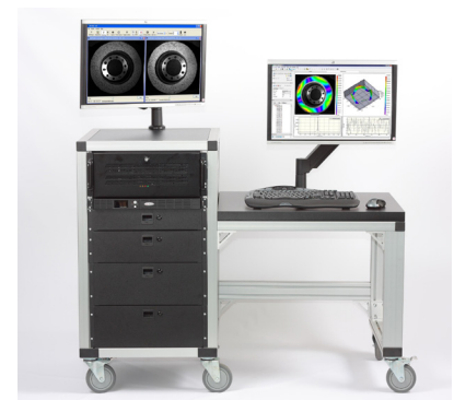
Rack-mount PC Workstation