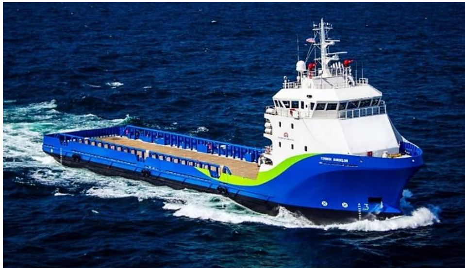
Offshore supply vessel Connor Bordelon under way.

On January 23, 2015, at 0432 central standard time, the offshore supply vessel Connor Bordelon struck the unmanned natural gas platform South Timbalier 271A, which was located about 5.25 miles south of the jetty channel entrance at the vessel's home port of Port Fourchon, Louisiana. The allision caused the pipelines attached to the platform to rupture and the natural gas and oil inside the pipelines to ignite. After the allision, the pipelines were shut down, and three good Samaritan vessels in the area applied water to put out the fire. The allision also caused a breach in the Connor Bordelon 's hull below the waterline, and the vessel began taking on water. The captain contacted the US Coast Guard to report the accident, and the Coast Guard released the Connor Bordelon from the accident area and allowed it to continue to Port Fourchon while the crew addressed the flooding. None of the 24 persons aboard the vessel were injured.