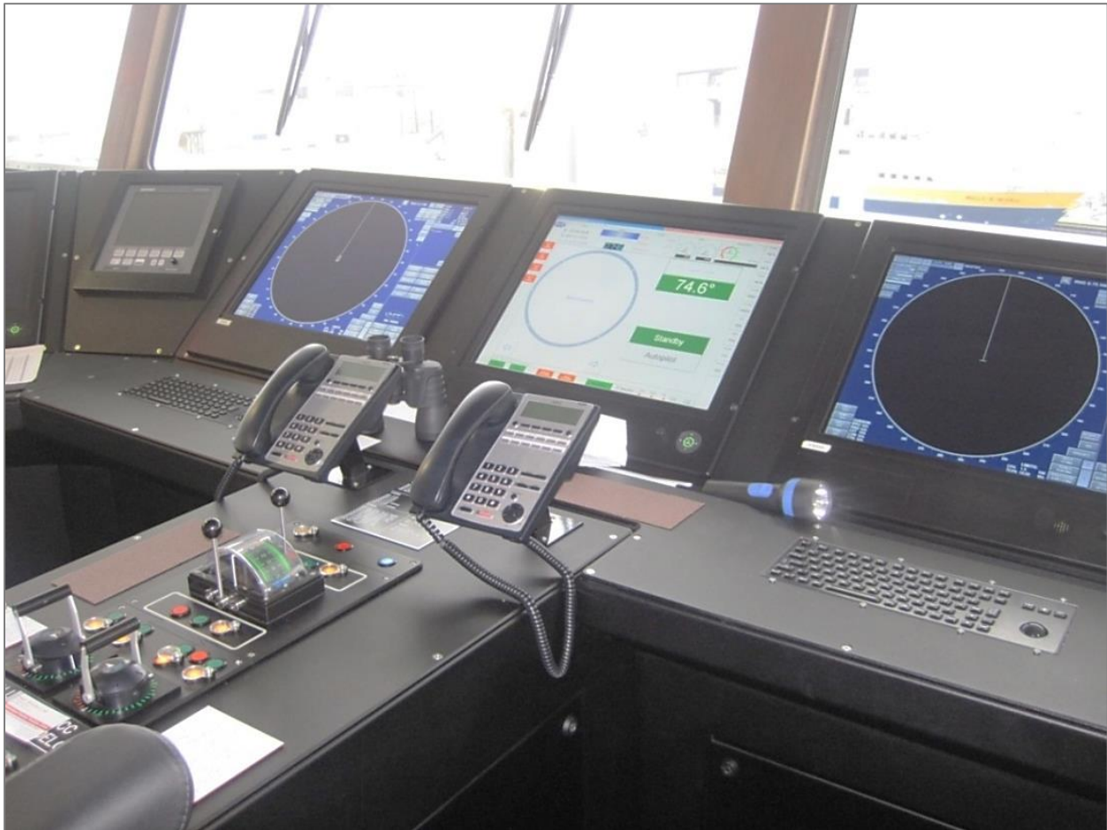
Conning station, where the mate on watch was located. The autopilot is located in the center, and radars are located on both sides of the autopilot. Manual controls are located on the center console.

The mate on watch stated that he was using the autopilot to operate the vessel. He had adjusted the heading from 011 to 017 degrees to account for the northeast winds, which were setting to the west, and to aim for the “hole in the wall,” an area in the Gulf of Mexico with wide separation between the charted platforms. He was independently controlling propulsion engine rpm and was maintaining a speed of about 8 knots.