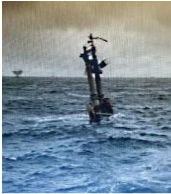
The left photo shows the unmanned platform South Timbalier 271A before the accident, and the right photo shows the remains of the platform after the allision and fire.