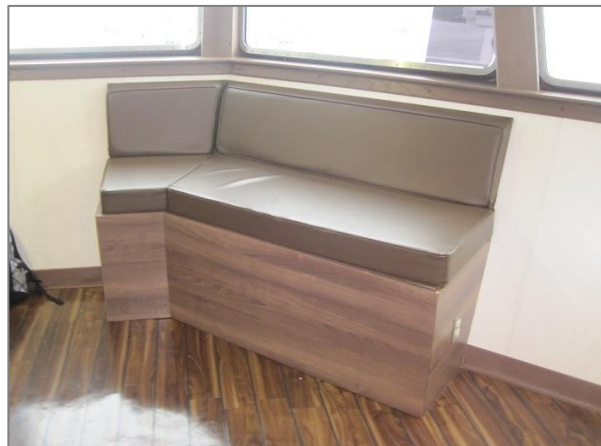
The left photo shows the captain's office on the port side of bridge, where the OS was located just before the allision. The right photo shows the settee on the starboard side of the bridge, where a mate was resting just before the allision.