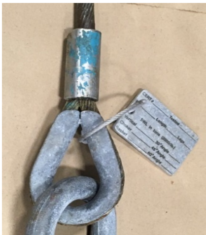
Figure 1: Fitting has a uniform appearance.

This Safety Alert addresses the importance of verifying the condition and manufacturing of wire rope terminations used in various systems that utilize wire rope in a load-handling capacity (e.g., lifesaving appliances, cranes, lifting slings). The Coast Guard is currently investigating a casualty involving a failed wire rope termination that resulted in extensive damage to equipment.