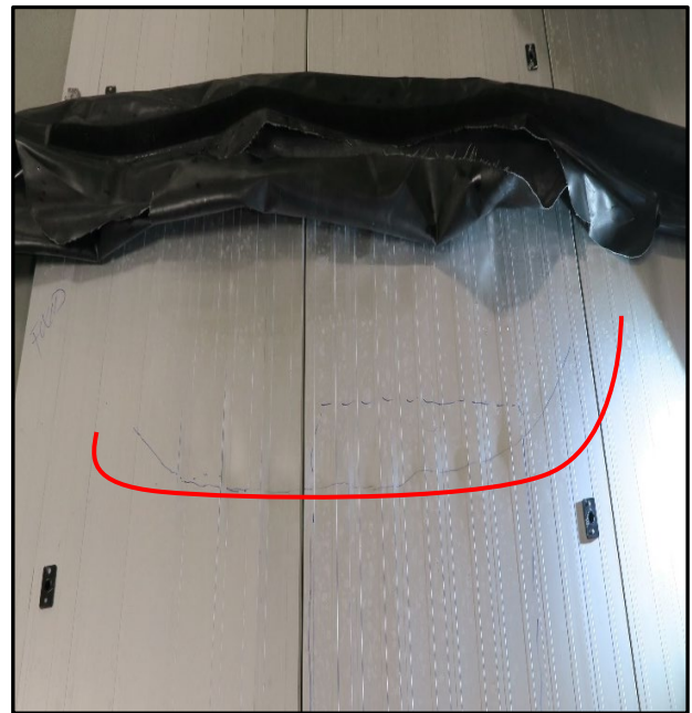
Figure 2 – Ruptured keel bladder and the view of the underside of the metal hull. The red line has been added to highlight the deformities in the hull metal due to the keel bladder rupture.

An investigation has identified that the keel bladder suffered a rupture due to excessive pressure in the tube. The recommended operating pressure by the manufacturer is 3.4 pounds per square inch (p.s.i) or 240 millibar pressure (mb). An on-scene survey of multiple inflatables on board the cruise ship noted pressures up to and exceeding 9 p.s.i. (620 mb) in other keel bladders. The keel bladder is not protected by a safety relief valve, and the manufacturer recommends that they be inflated with a foot pump to reduce the chance of over-pressurization. However, crewmembers were routinely using an air compressor to fill the buoyancy chambers (including the keel tube) prior to the incident. In addition, pressure levels were not being checked using a manometer as recommended by the manufacturer.