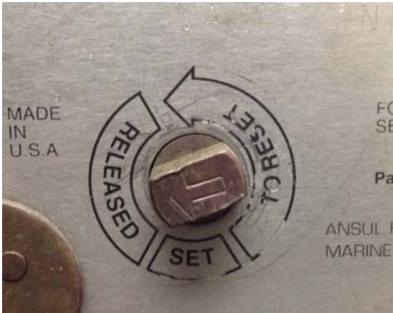
Pictured above is a release indicator for an ANSUL system.

The photo on the right is an example of a second visual indicator for checking system status. It indicates the pressure switch position for the CO 2 system. If the indicator is in the down "SET" position, no CO 2 has been released and the system is ready for operation. If the indicator is in the up position, it indicates that the system has been "OPERATED" and that the proper servicing company should be contacted immediately to bring the system back to readiness.