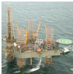
Self-Elevating Unit (Independent-Leg)