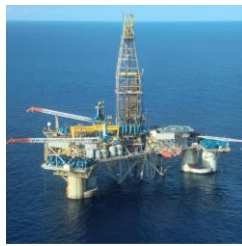
Column-Stabilized Unit (Moored)