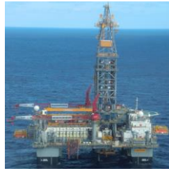
Column-Stabilized Unit (Dynamically Positioned)