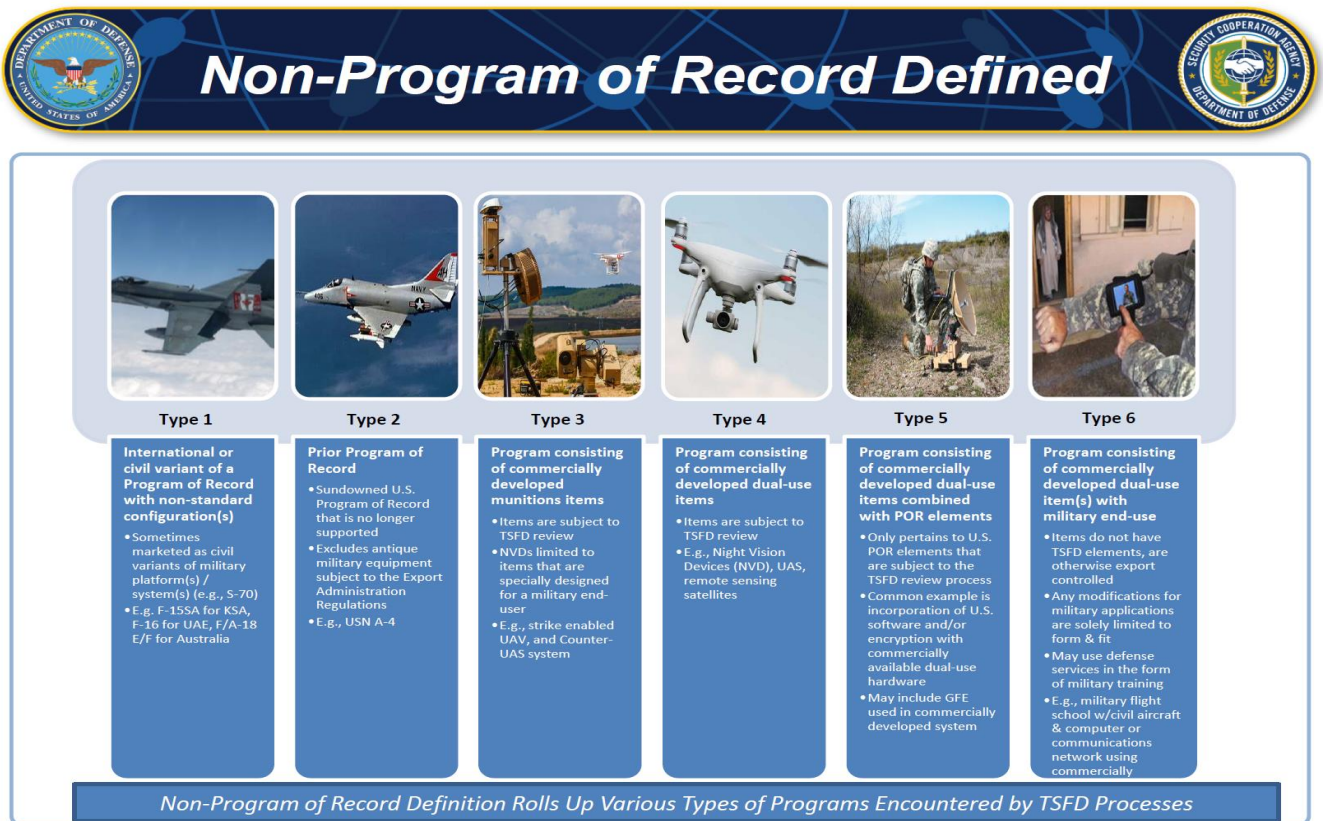
Figure 2: Types of Non-Program of Record

Figure 1 illustrates a complex NPOR spectrum that requires tailored solutions to ensure the technology security and foreign disclosure (TSFD), and unplanned or unresourced support, such as contracting, interoperability, cyber, training, sustainment, airworthiness, etc., are addressed by Implementing Agencies (IA) (which include Military Departments and DoD Agencies) prior to export. POR activities require fewer, if any, tailored solutions to export the system or capability to foreign partners. In contrast, NPOR activities (including NPOR, prior POR, NPOR in U.S. Inventory, POR competitor, Early Adopter, and Industry-developed solution(s)) are capabilities and systems that usually require tailored development, testing, and/or USG acquisition to ensure the TSFD, interoperability, cyber security, training, sustainment, airworthiness, and any unplanned or unresourced support is addressed by the DoD Implementing Agency (IA). As a result, the complexity and level of effort associated with capabilities and systems increases as they trend to the right on the NPOR spectrum (Figure 1).