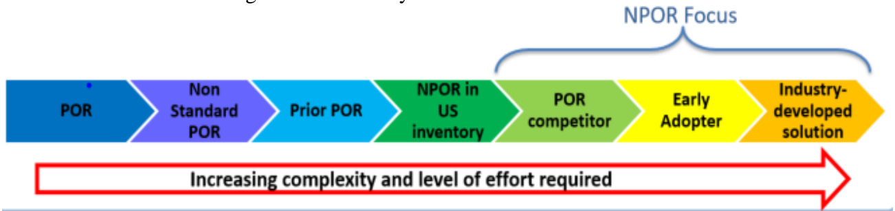
Figure 1: Non-Program of Record Spectrum

have identified the following criteria to clarify what constitutes an NPOR.