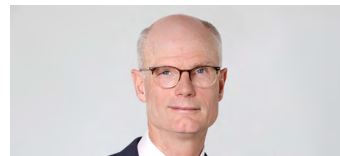
Stef BLOK Netherlands