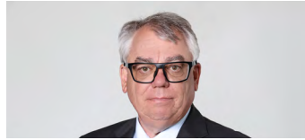
Klaus-Heiner LEHNE Germany