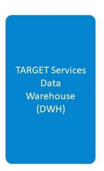
Figure 1 - High level DWH coverage

Each component of the T2 Service and T2S has its dedicated production database. The DWH consolidates the content of those production databases into a single database for operational and statistical purposes for the operator, CBs, ancillary systems and payment banks. It is ensured that the provision of data from production databases to the DWH does not influence the functioning and availability of the T2/T2S Services and the respective underlying production databases.