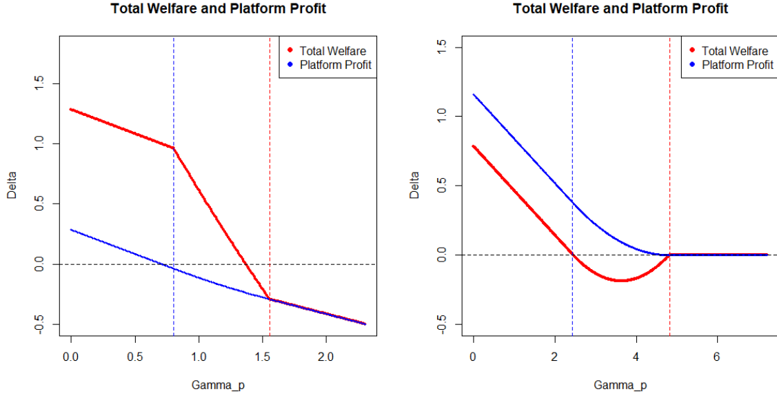
(a) Social welfare always increases with platform financing (b) Social welfare may decrease with platform financing