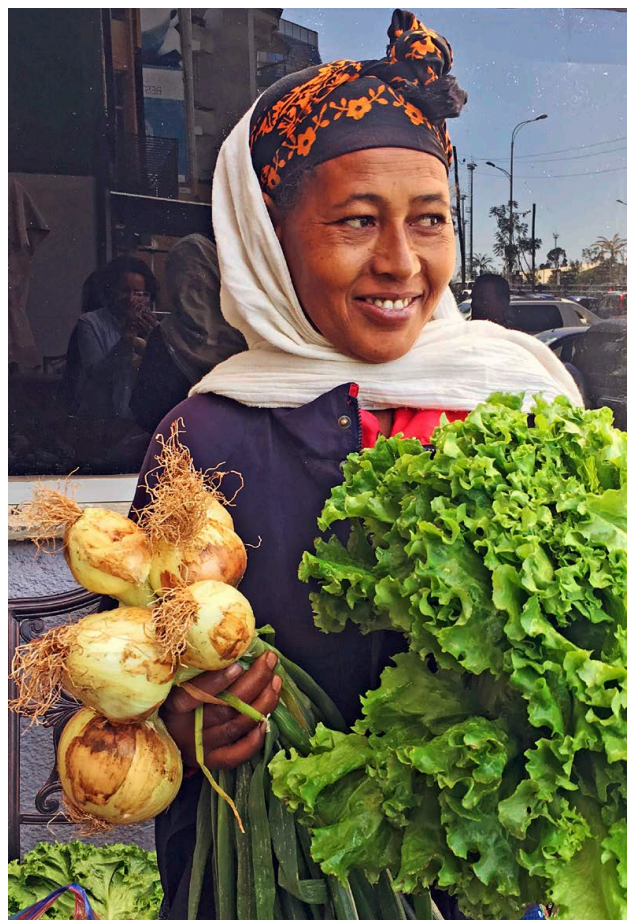
Organic vegetables market, Addis Ababa, Ethiopia.

5. The AFS Network – through webinars and online exchanges – contributed to an increased integration of climate resilient agriculture, agroecology and rural-urban linkages in bilateral programmes of the SDC's South Cooperation.