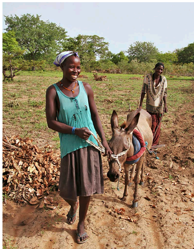
Animal traction ploughing, Burkina Faso.

Outcome 1.3: Development and implementation of international frameworks, voluntary guidelines or technical standards deriving from the right to adequate food. The GPFS focuses its interventions in relation to its three components on agroecology, markets and healthy nutrition.