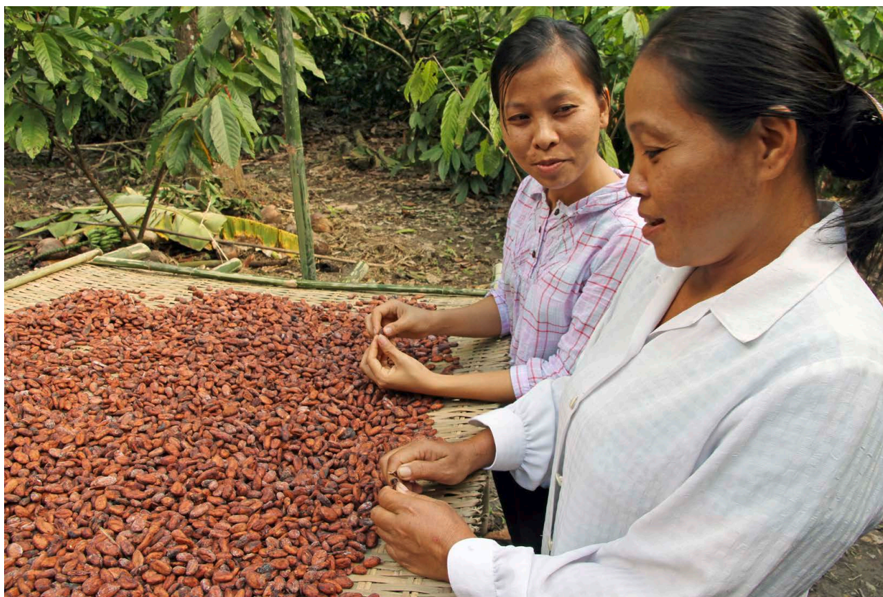
Women discussing on cocoa beans drying, Ben Tre Province, Vietnam.