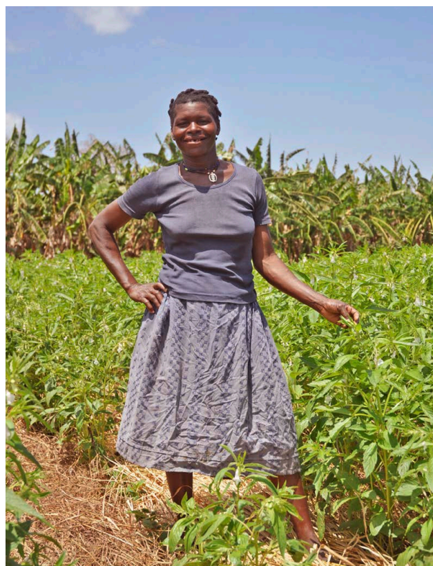
Woman farmer proudly showing her agroforestry field. Cabo Delgado, Mozambique.

Outcome 2.2: Co-creation and sharing of knowledge, including local and scientific innovation in the context of improving resource efficiency, increasing diversity and strengthening resilience. This will be addressed among other ways through youth- and gender-responsive rural advisory systems.