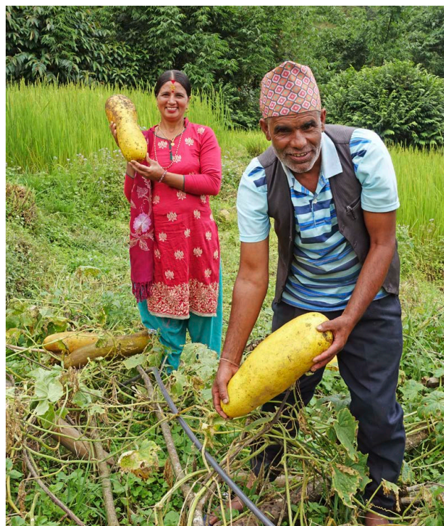
Diversification through vegetable production, Nepal.

Outcome 3.2: Resilience of women and young smallholder farmers are strengthened through safety nets and risk transfer mechanisms.