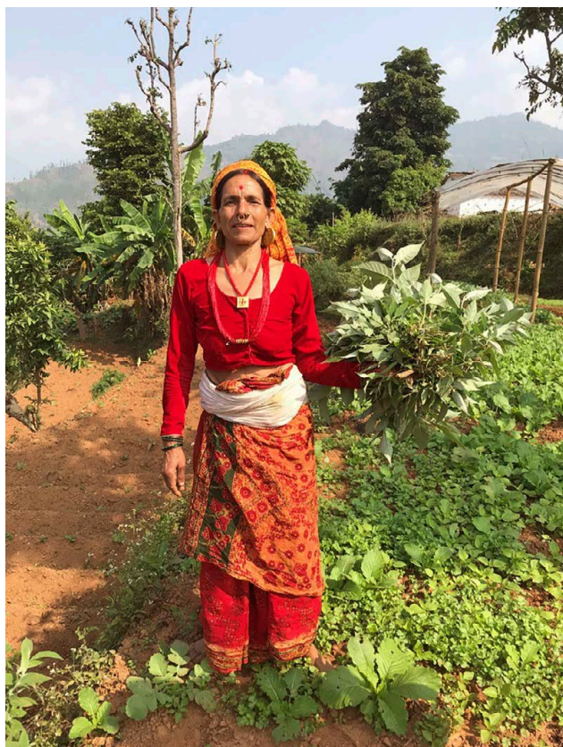
Woman in her organic family kitchen garden, Karnali Province, Nepal.

Outcome 4.3: Enhanced consumer demand and desire for healthy and sustainably produced food choices through information and behaviour change.