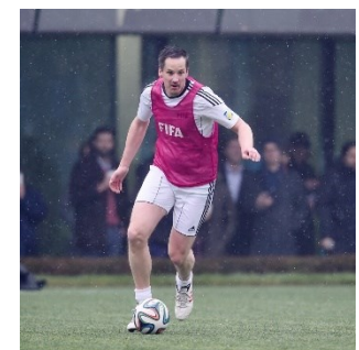
In connection with meetings between Switzerland's attorney general and FIFA's president, the senior prosecutor of the canton of Valais was also mentioned, seen here in a friendly match.