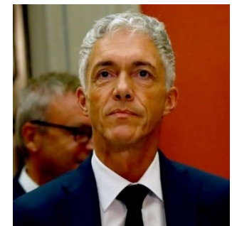
Attorney General Michael Lauber

News stories concerning the Office of the Attorney General of Switzerland (OAG) regularly appeared in the foreign media during the months leading up to Swiss Attorney General Michael Lauber's resignation at the end of July 2020. The focus was on a number of cases concerning international football: e.g., the statute of limitations in the 'summer fairy tale' trial concerning irregularities in the awarding of the 2006 FIFA World Cup, and new details of meetings between the Swiss Attorney General and FIFA President Gianni Infantino. The decision to drop one of the cases against former FIFA president Sepp Blatter was also met with - sometimes-harsh - criticism, particularly in the European and US media. Several media outlets accused the OAG of bias and lack of credibility. In relation to a Russian money laundering case, European and Russian media were critical of the acceptance of gifts by Lauber's top Russia expert as well as the OAG's plans to share sensitive witness statements with Russian authorities, counter to international guidance. The international media also reported on calls by Swiss parliamentarians for Lauber to step down, Lauber's hearing before the parliamentary judicial committee, the launch of impeachment proceedings against Lauber, as well as Lauber's resignation in July 2020. The media reacted positively to the OAG's decision to open a criminal probe into Glencore over alleged corruption in the Democratic Republic of the Congo.