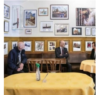
Covid-19: The hospitality sector also sees changes as the country opens up.

News of food parcels being handed out to people in need in Geneva was reported around the world in May, due to the story being at odds with Switzerland's stereotypical image as a wealthy country. In June the media covered numerous studies which indicated on the one hand that Switzerland was a safe country in regard to COVID-19, and on the other hand that its extensive easing of restrictions was placing it at risk of a second wave. The overall tone in the foreign press was positive: despite some initial failures, Switzerland now appeared to be handling the crisis well. There was some discussion about Switzerland's Epidemics Act possibly acting as a model for other countries.