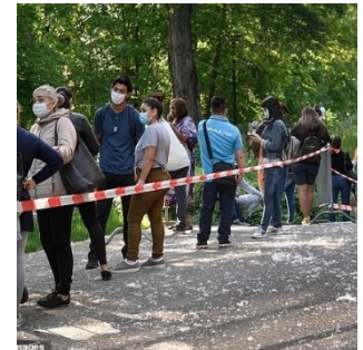
Covid-19: People in need queuing for food parcels in Geneva