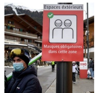
COVID-19: coverage focusing on open ski resorts