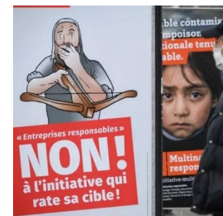
Posters publicising the Responsible Business Initiative