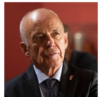
COVID-19: statements by Federal Councillor Ueli Maurer were widely reported