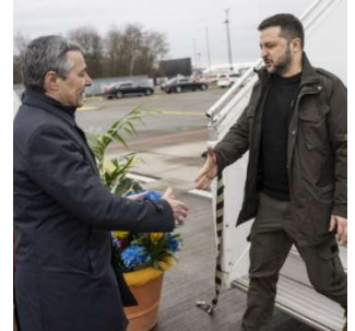
Zelenskyy's visit and the announcement of a peace conference in Switzerland received much media coverage.

offices. Swiss solidarity with Ukraine also received much media coverage. Many articles appeared in the Russian media criticising the planned conference, primarily because of Russia's likely absence. Furthermore, some commentators questioned Switzerland's legitimacy as a host, arguing that it had abandoned its neutrality by accepting EU sanctions. These points of criticism were repeated at a meeting between Federal Councillor Ignazio Cassis and Russian Foreign Minister Sergey Lavrov on the margins of a UN Security Council meeting, according to Russian media reports. In addition, Russian and Asian media reported repeatedly on the invitation to China extended by Mr Cassis. Up to the end of March, Western media only occasionally reported on Switzerland's role as conference host, and this coverage was factual. It was not until the Federal Council announced at the beginning of April that the conference would be held in June that Switzerland once again became a focus of global media attention.