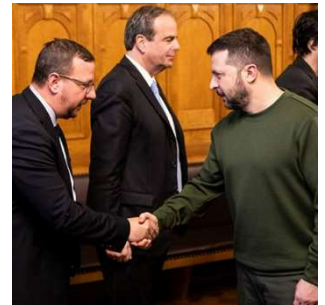
Zelenskyy in dialogue with Swiss politicians.