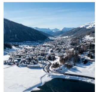
Davos was at the centre of reporting on accusations of antisemitism in Switzerland.

occurrence of such cases in Switzerland. One example surrounded accusations of antisemitism in connection with a notice posted by a mountain station in Davos, according to which Jewish guests would no longer be lent sports equipment due to negative experiences. Several reports pointed to similar previous incidents in Swiss touristic areas. A knife attack on an orthodox Jew in Zurich by a 15-year-old Swiss teenager with Tunisian roots also received a great deal of attention. The reporting remained mostly factual and Switzerland was not accused of being generally antisemitic. However, individual German media outlets discussed a study according to which antisemitic incidents in Switzerland had risen sharply in recent months.