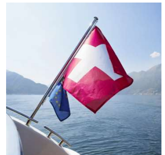
Resumption of negotiations between Switzerland and the EU

respective negotiating mandates and the subsequent start of negotiations. In terms of volume, however, reporting abroad remained limited. Media coverage of the proposed treaty package was largely factual, emphasising the economic benefits for Switzerland. However, given the wide-ranging domestic opposition in Switzerland to an agreement with the EU and the complex political system, there are numerous hurdles to a successful conclusion of the negotiations, according to the foreign media.