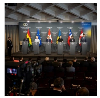
Heads of state from the Global South were also present at the press conference.