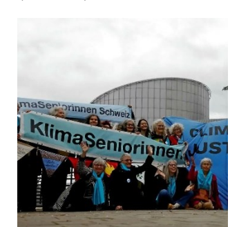
The 'Climate Seniors' from Switzerland receive support on social media.