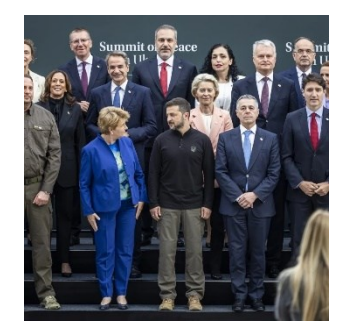
The group photo with numerous international political dignitaries in attendance received a great deal of visibility

with the ruling. These reports speculated on whether Switzerland's stance might diminish the court's authority and the impact of its rulings in other nations.