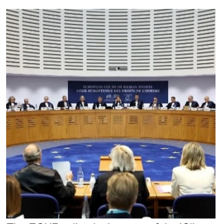
The ECHR ruling in the case of the 'Climate Seniors' was often interpreted against the background of the situation in the respective media outlet's country.