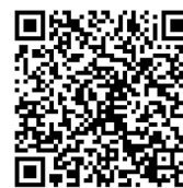
FILE A CHARGE LINK

You can send the EEOC a signed letter describing your employment discrimination concerns. This signed letter becomes what the EEOC calls a "charge of discrimination" that states an employer, union, or employment agency unlawfully discriminated against you. EEOC.gov has a list of information that you need to include in the letter. The EEOC will review your letter and let you know if more information is needed.