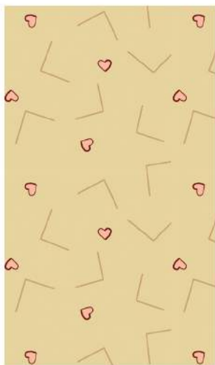
NV 210 302 Love Letters - Sand