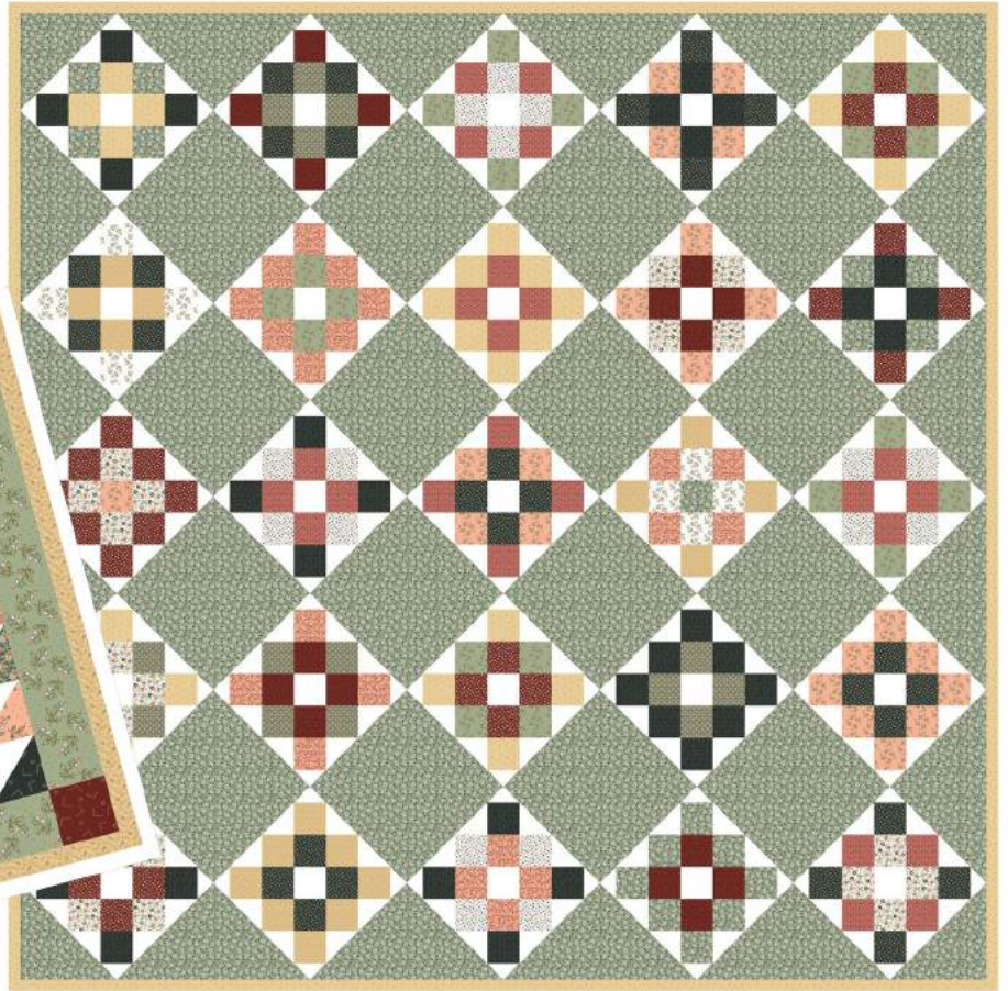
State Fair 87" x 87" (218 x 218 cm)