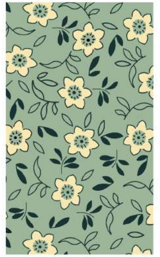
NV 210 102 Rose Hip - Glacier Blue