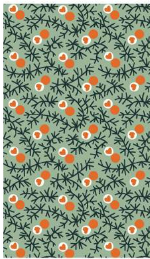
NV 210 203 Sweetheart - Glacier Blue