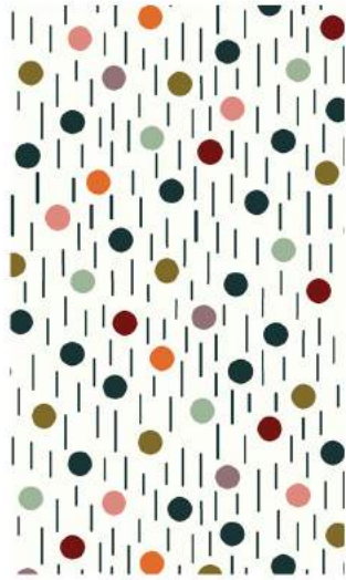
NV 210 401 April Showers - Cream