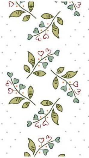
NV 210 501 Lily Of The Valley - Cream