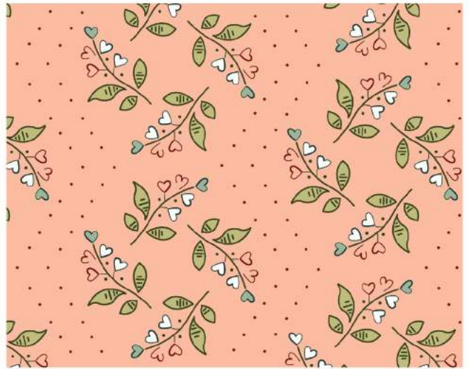
NV 210 503 Lily Of The Valley - Frosted Pink