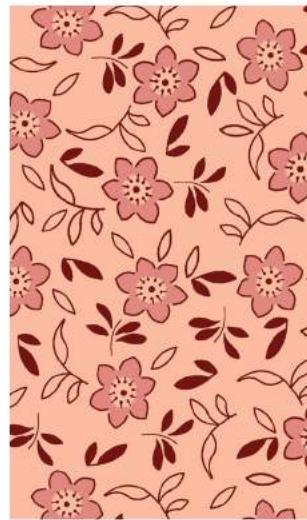
NV 210 103 Rose Hip - Frosted Pink