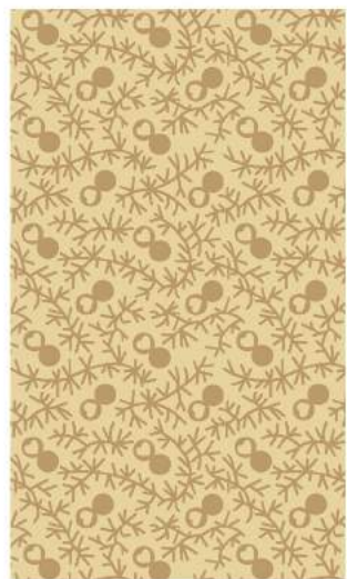
NV 210 202 Sweetheart - Sand