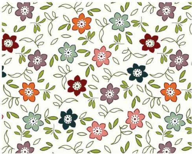
NV 210 101 Rose Hip - Cream