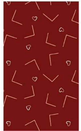
NV 210 301 Love Letters - Cranberry Red