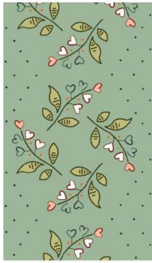
NV 210 502 Lily Of The Valley - Glacier Blue