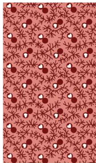
NV 210 201 Sweetheart - Coral Pink