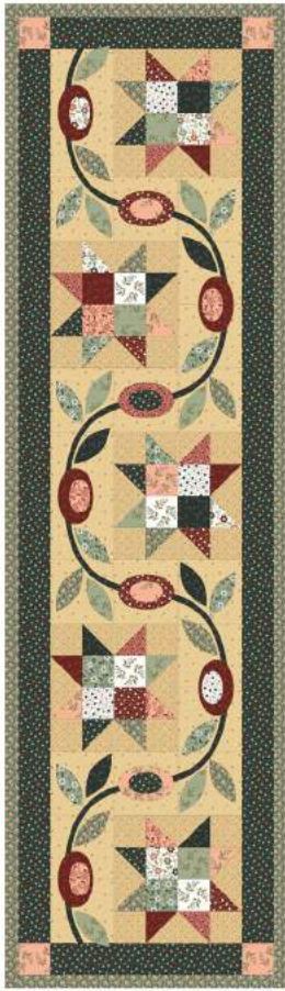
Starflower 46" x 13" (115 x 33 cm)