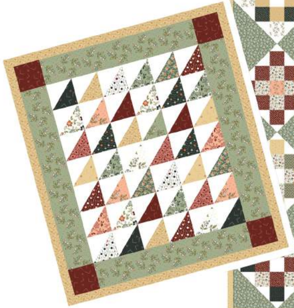
Fly Away 13" x 14 1/2" (33 x 36 cm)