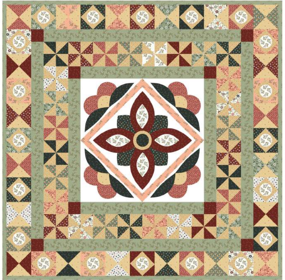
Peony 34" x 34" (85 x 85 cm)