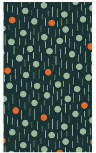
NV 210 403 April Showers - Midnight Blue