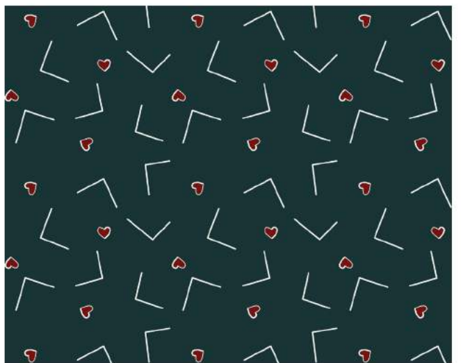
NV 210 303 Love Letters - Midnight Blue