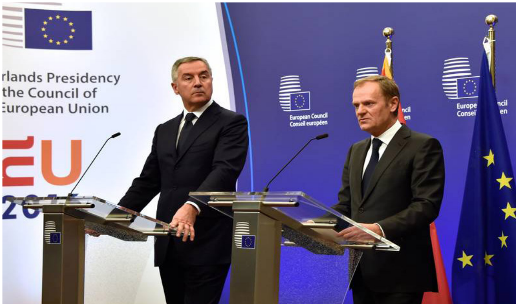
President Milo Djukanovic meets with Donald Tusk, President of the European Council, June 2018.

2017, photos of Sindjelic and Shishmakov meeting in a Belgrade park were made public. 45 Finally, Patrushev's presence for the extraction of Shishmakov and Popov not only indicates the depth of their involvement in the attempted coup, but it also suggests—at the very least—official Russian endorsement of the project. The Kremlin denied any involvement in the coup attempt. 46