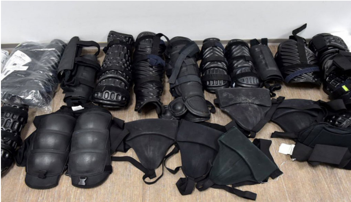
Evidence (equipment allegedly prepared for the coup) presented by the Montenegrin prosecutor.

military port should not be underestimated. For example, the Russian Naval Facility in Syria's Tartus is that navy's only repair-and-replenishment port in the Mediterranean. According to Russia and Middle East expert Anna Borshchevskaya, "A port allows a country to project power and support military operations. Russian naval presence in the Eastern Mediterranean helps protect against a possible blockade seeking to punish or topple the Bashar al-Assad government in Damascus." 11 The Russian navy further has an operational role in the conflict, as demonstrated by the deployment of Russia's sole aircraft carrier Admiral Kuznetsov and its Northern Fleet strike group in October 2016. Although playing a secondary role in airstrikes, 40 Russian naval aircraft conducted a sizeable number of sorties in Syrian—over 400 in a two-month period, hitting a reported 1,252 targets, according to Russian news. 12