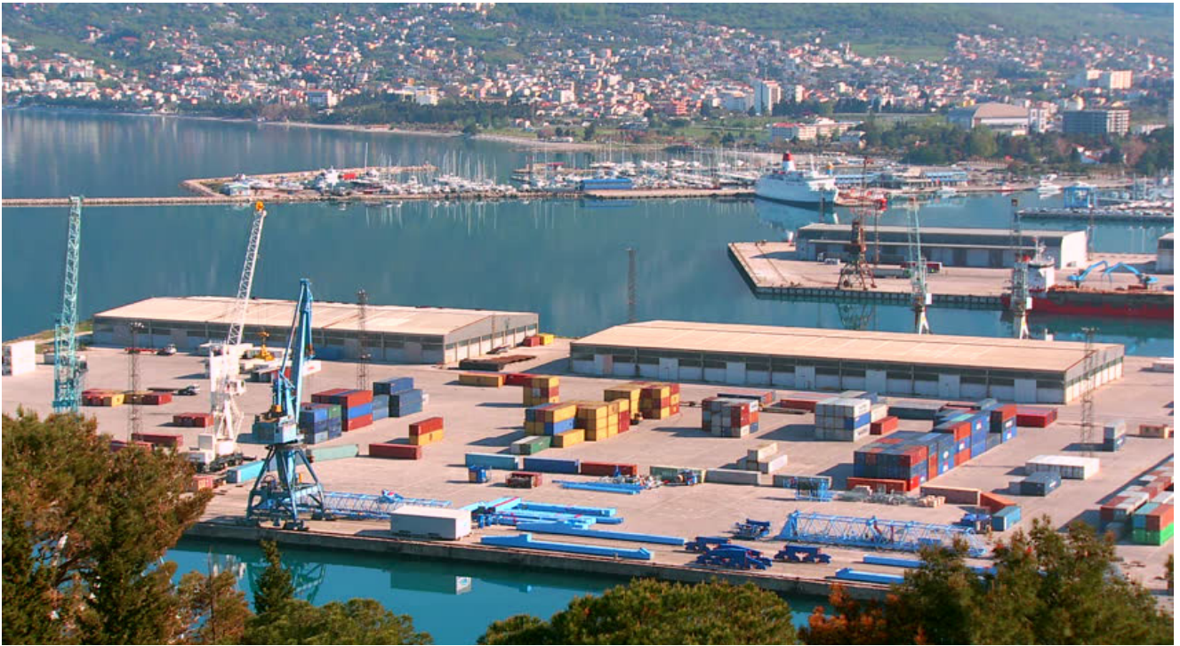
Port of Kotor, Montenegro.

Under the leadership of Milo Djukanovic, 6 Montenegro consistently has sought deeper relations with the North Atlantic Treaty Organization (NATO) and the European Union (EU). However, a considerable minority (approximately 35-40%) 7 of the population remains skeptical of this path. 8 These segments question Montenegro's Euro-Atlantic partnerships for a variety of reasons, including the historical permeation of Pan-Slavism with attendant Pan-Orthodox leanings 9 and resentment of the 1999 NATO bombing campaign