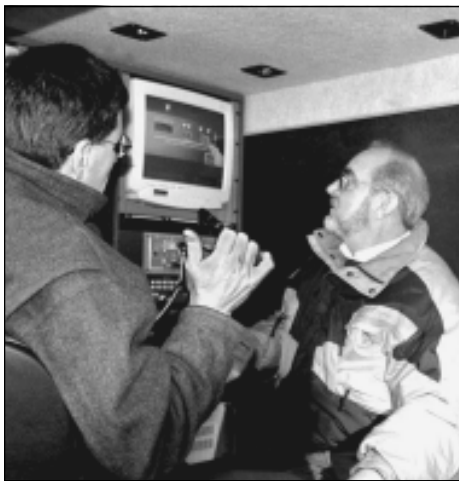
Image Sensing Systems Inc. demonstrates a program to Rep. Henry Kalis that allows a camera to track the speed at which cars are traveling. The system also can be used to catch those who run red lights.

Rep. Dan Larson (DFL-Bloomington) asked about systems that might automatically alert emergency responders to an accident. Beers answered that such systems are becoming increasingly common in passenger vehicles.