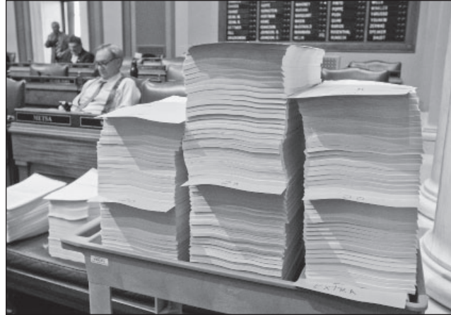
Stacks of floor amendments.

In the House, the language of the bill that already has passed the Senate automatically takes the place of the language that was recommended by the House committee. If the chief sponsor wants to go back to the House language, he or she makes a motion to amend the bill when it comes up for action on the