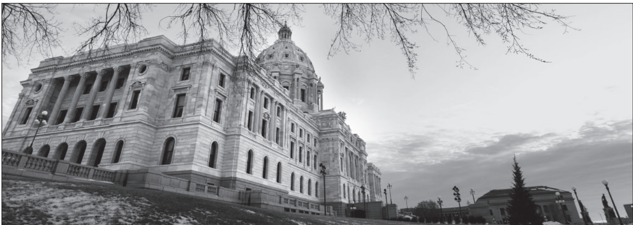
The Minnesota State Capitol.

Conciliation courts, also know as "small claims courts," hear civil disputes up to $15,000. However, disputes over consumer credit transactions must be no more than $4,000 to be heard in conciliation court.