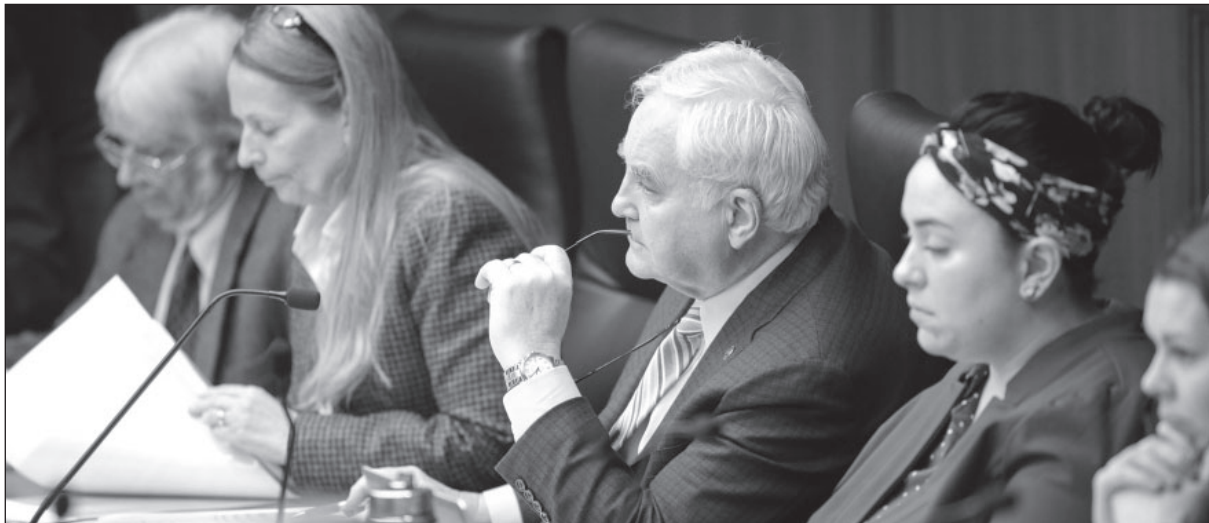
House Ways and Means Committee.

In the second year of the legislative session, the tax committee and finance committees consider adjustments to the budget adopted for the biennium. In the case where there is a projected balance for the biennium, those adjustments may include spending increases and tax reductions. In the case where there is a projected deficit for the biennium, those adjustments may include spending reductions and tax increases. The ways and means committee may adopt another budget resolution to provide direction for those adjustments.