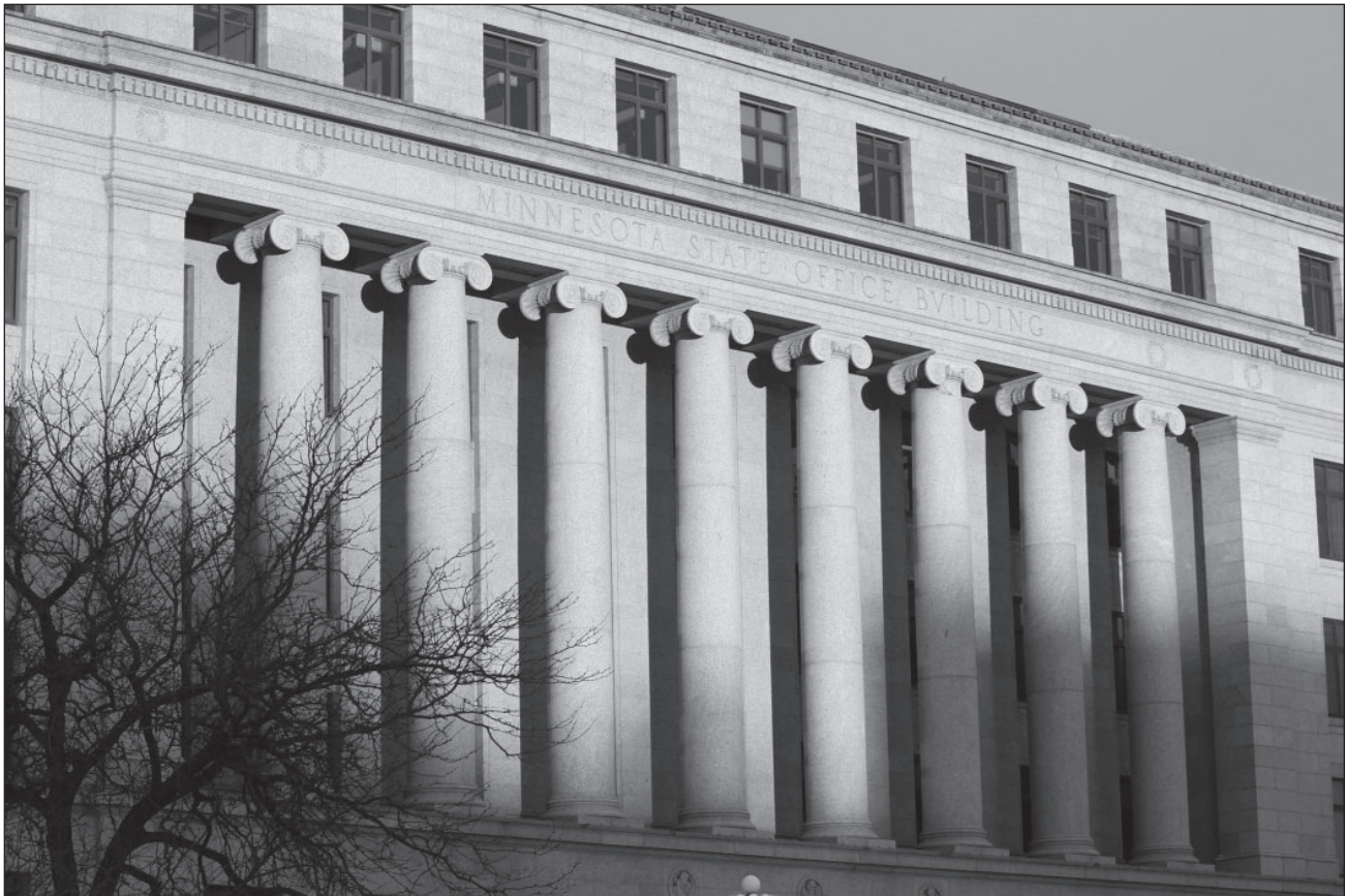
The State Office Building.

A formal procedure required by the state constitution and rules. These readings indicate to legislators and the public that an action or series of actions have been taken on a bill or resolution, and the matter has reached the next stage in the legislative process. Bills receive their first reading at the time of introduction, their second reading after adoption of committee reports and their third reading before placed upon final passage. Bills