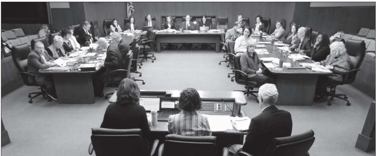
House Education Finance Division.

Opponents and proponents of a measure may testify before the committee. Any resident may express views at these hearings. The chief sponsor can invite witnesses to speak for the bill. Opponents may also organize interested people to testify. All testifiers are subject to questioning by the committee.