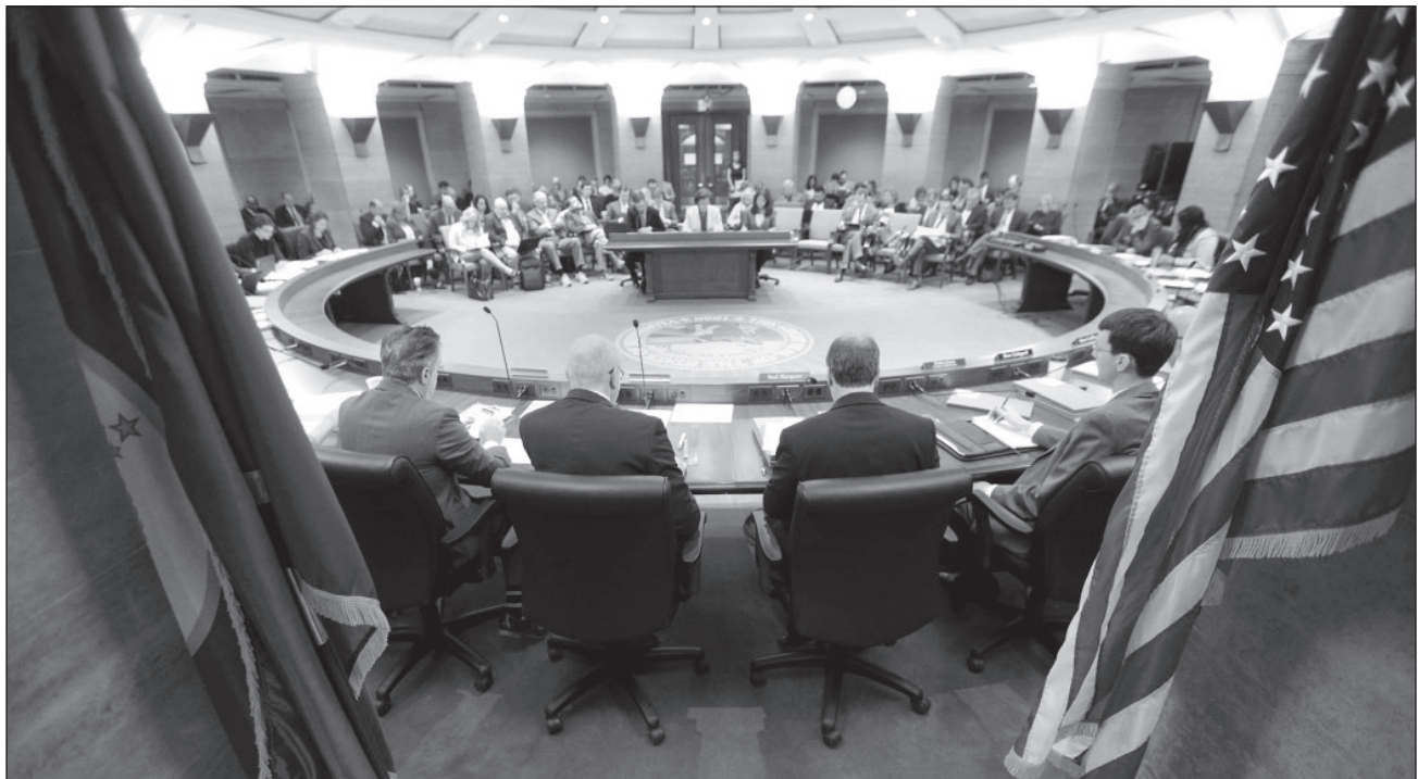
Tax conference committee.

Like regular committees, these committees are staffed by House and Senate employees who keep the revisor informed on the progress of the conference