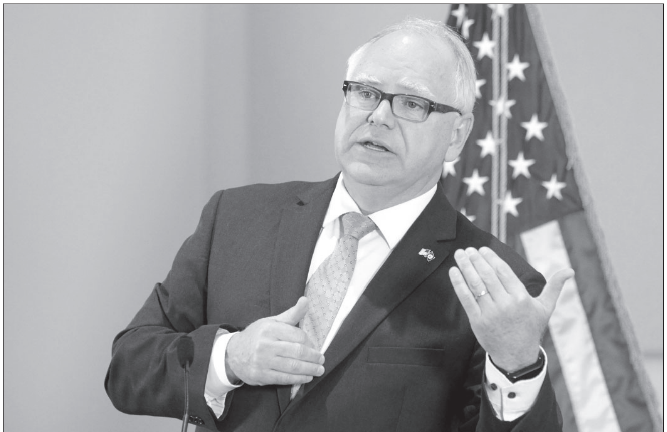
Gov. Tim Walz addresses the media at a press conference.

Any legislation to be considered must follow the same steps that would be required in a regular session.