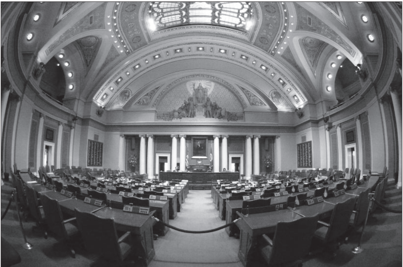
The House Chamber.

Due to scheduling conflicts, assignment to one committee may preclude another committee assignment.