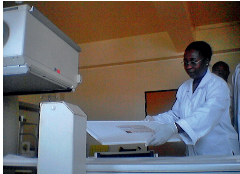
A medical physicist measures uniformity of images from a gamma camera as part of the quality assurance process.