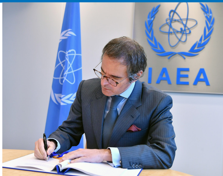
IAEA Director General Rafael Mariano Grossi signing the Safeguards Agreement and Additional Protocol with Eritrea on 20 April 2021.

An AP may be concluded to any type of safeguards agreement. An AP to a CSA must include all the provisions of the Model Additional Protocol.