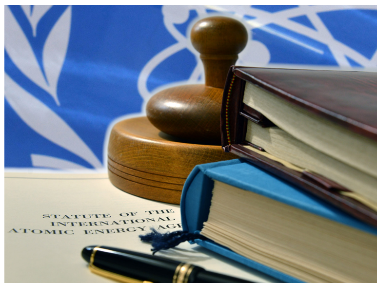
The IAEA Statute includes safeguards as one of the IAEA's main functions.

Although the Statute provides the IAEA with the authority to apply safeguards, it does not obligate States to accept IAEA safeguards as a condition of membership in the IAEA. Safeguards provisions contained in the Statute are applied only to the extent relevant to a specific project or arrangement, e.g. through a project and supply agreement (PSA) or a safeguards agreement concluded between a State and the IAEA.