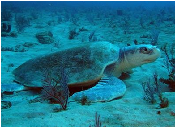
Atlantic Ridley Sea Turtle

Sea turtles have an excellent sense of direction, and it is said they can feel the magnetic field of the earth and use it as a compass. In a single year, a Leatherback sea turtle can travel 10,000 miles or more! Of the sea turtles pictured below, 3 out of 4 are endangered species, and the Loggerhead turtle is a threatened species. They are rare, so if you happen to see a marine turtle, consider yourself very lucky!