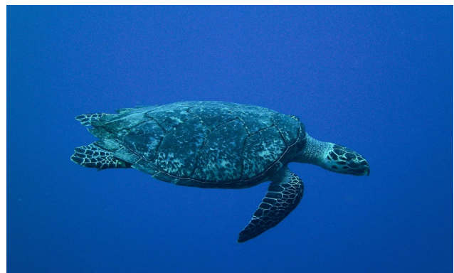
Leatherback Sea Turtle