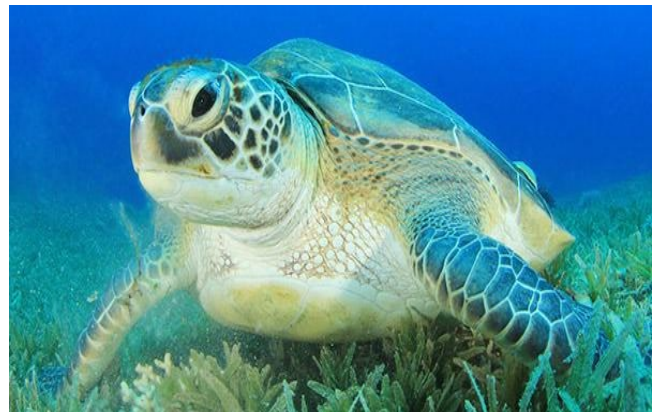
Atlantic Green Sea Turtle