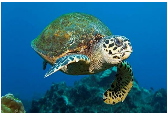
Loggerhead Sea Turtle