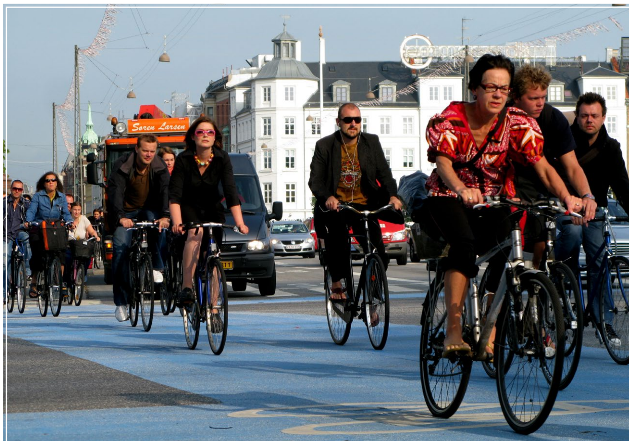
Bicycle rush hour in Copenhagen, Denmark.

Balance. Balance is a frame that speaks to the core values of centre-right audiences. Balance in this context means avoiding overly grand or ambitious claims and taking a common sense middle of the road approach. 22 For both centre-right and faith audiences, balance is also a frame that can be used metaphorically, for climate change as a symptom of the natural world being 'out of balance'. 23,24