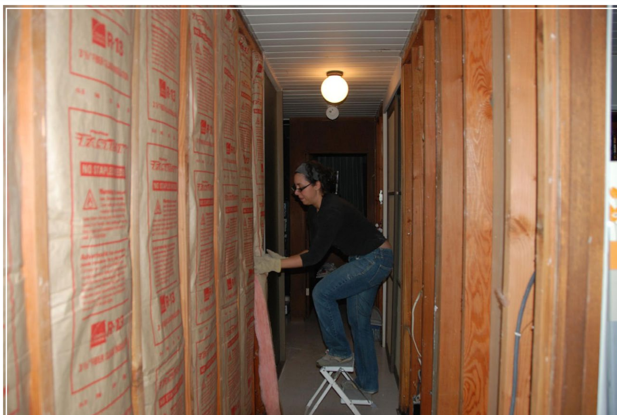
A woman installs insulation in her home.

Although this is a case study that applies to one country in particular (the UK - a lot of climate change communication research focuses on UK and US audiences), it provides a useful starting point for conversations about tackling climate change.