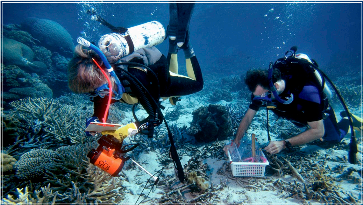
Marine biologists examining corals on the Great Barrier Reef in Australia.