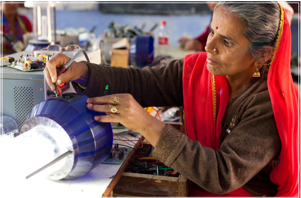
A solar engineer trainer in India.