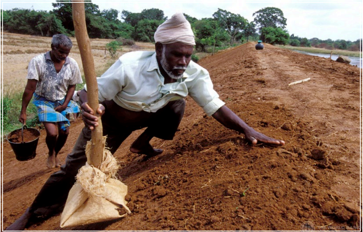
Two men repair breached sections of embankment in Sri Lanka.