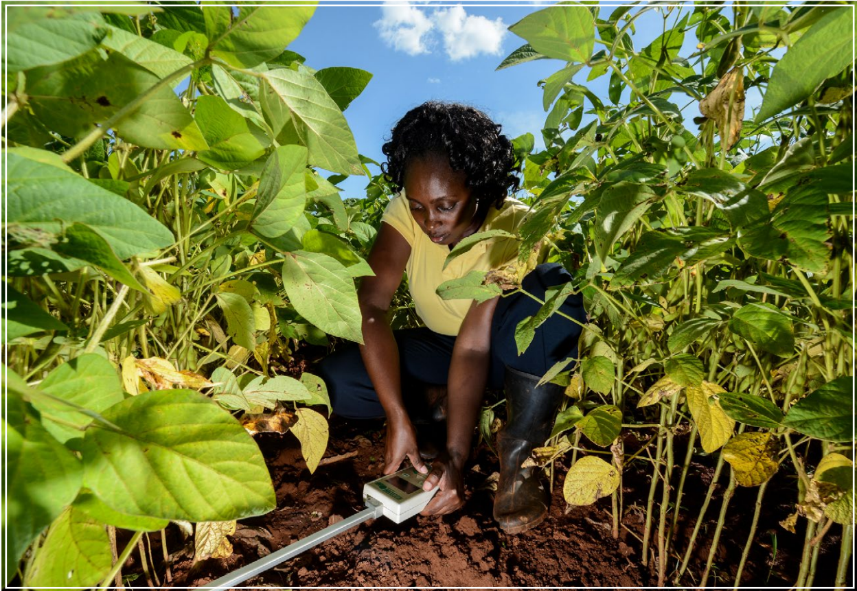
Testing soil health in Kenya.

Stories – that is presenting information in a narrative format – offer a way of building more sustainable and meaningful engagement with science because people are more used to communicating information through stories than graphs and numbers. 52 The concept of using the narrative form for communication has become increasingly common among science communicators. 53 Not only does the use of narratives help public audiences understand complex and abstract science issues, 54 but it also makes the science easier to remember and to process relative to traditional forms of scientific communication (such as lists of facts or the use of graphs and figures). 55 Communicating science in a narrative form is more effective when those narratives use language that reflects the concerns of the audience.