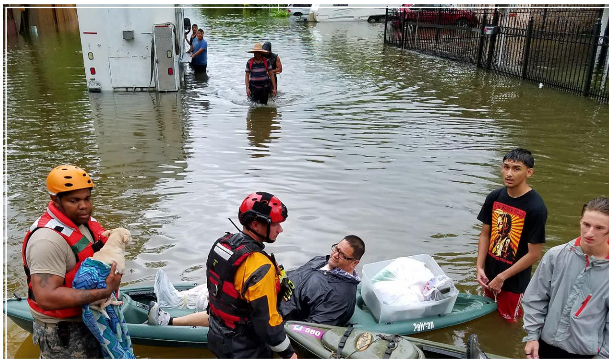
Texas National Guard soldiers help victims of Hurricane Harvey in the US.