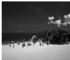
The Ends of the Earth