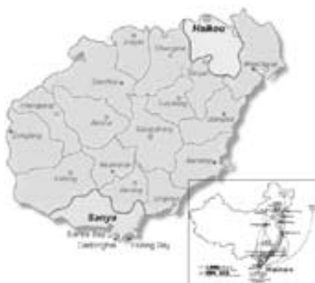
Picture 3.The map of Hainan province

Hainan province is divided into 2 prefecture-level cities (Haikou city and Sanya city ), 6 county-level cities ( Wuzhishang city, Qionghai city, Danzhou city, Wenchang city, Wanning city and Dongfang city ), 4 counties ( Dingan county, Tunchang county, Chengmai county and Lingao county ) and 6 autonomous counties ( Baisha Li nationality autonomous county, Changjiang Li nationality autonomous county, Ledong Li nationality autonomous county, Lingshui Li nationality autonomous county, Baoting Li and miao nationalities autonomous county, and Qiongzong Li and miao nationalities autonomous county ). ( Picture 3 )