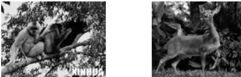
BlackCrown Gibbon monkeys