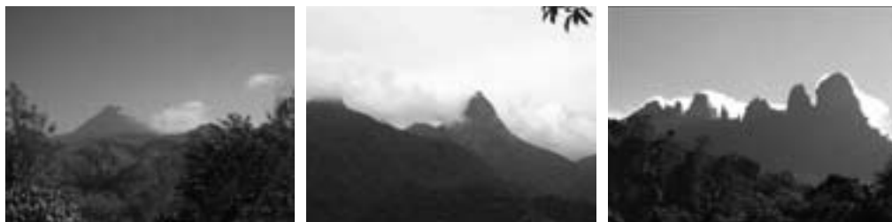
Five Fingers Mountain

descending outwards from the center. The island is made up of by mountainous regions, rugged hills, terraces, and plains with clear stratified physiognomy in the shape of loop. Mountainous regions and hills take up 38.7% of the whole island, and are the main features of physiognomy in the island. The province has 154 rivers flowing into the sea, the top three of which are the Nandu River, the Changhua River and the Wanquan River. Mostly the coasts are accumulated from eroded volcano basalt in the terraces, evolved from low vale to small bay or accumulated coasts, and layered coasts formed by sand banks. Its coastlines is 1528 kilometers long with sandy beaches. Tropical mangrove and coral reef coasts feature the coastal ecosystem.