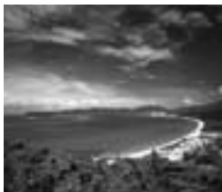
Yalong Bay, Sanya

Tourism is now shaping up to accommodate holidaying tourists, featuring along with the tropical seashore vacationing, spas, golf, scuba diving, tropical animals and plants sites, characteristic foods ( Picture 7 ) and the Li (Picture 8 ) and Miao folklore tours.