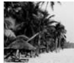
coconut trees, Wenchang city