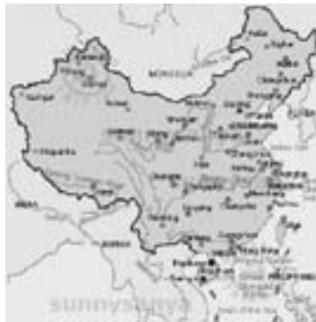
Picture 1. The map of China ( Hainan province is situated in the southernmost corner of China )

Hainan Province is situated in the southernmost corner of China, Hainan island at 18^{\circ} 10' \sim 20^{\circ} 10' N latitude and 108^{\circ} 37' \sim 111^{\circ} 03' E longitude takes the shape of a large oval pear, being in tropical and subtropical zones. The length from northeast to southwest is about 290 kilometers, and the width from northwest to southeast is about 180 kilometers, with a total area of 33900 square kilometers. It faces Leizhou Peninsula across Qiongzhou Channel to the north, Vietnam across the North Bay to the west, and Malaysia and Indonesia across the South China Sea to the south, and is closely joined by the South China Sea and islands. (Picture1)