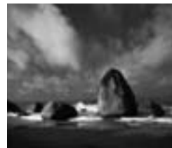
A Pillar Piercing into the Southern Sky