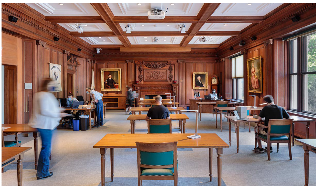
Ellis Hall at the Massachusetts Historical Society

In January 2021, we kicked off a project to give our website a fresh new look. Working with M4 Interactive, a website design and development agency, we analyzed our existing site and content management system, discussed new ways to pres-