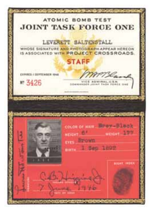
Identification of Leverett Saltonstall for Project Crossroads, Atomic Bomb Test Joint Task Force 1. Collections of the MHS.

The fall of 2010 brought to completion another new MHS website, The Siege of Bos -