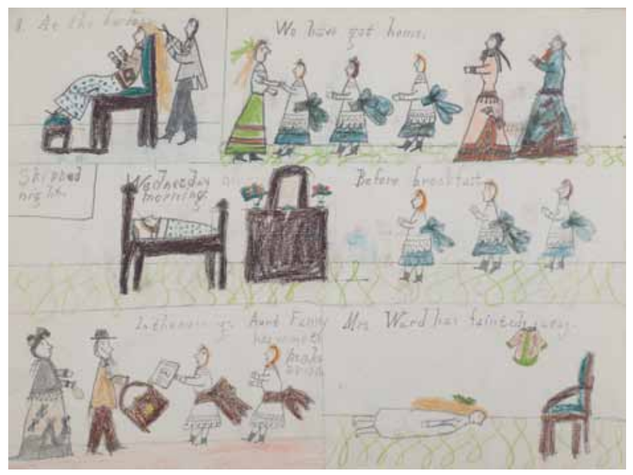
Detail from Bertha Louise Cogswell drawing books, volume 3, ca. 1876–1880. Collections of the MHS.

Smith detail his service with the Twenty-Fifth Massachusetts Infantry Regiment from 1861 to 1865, complete with extensive descriptions of the Battles of New Bern and Cold Harbor.