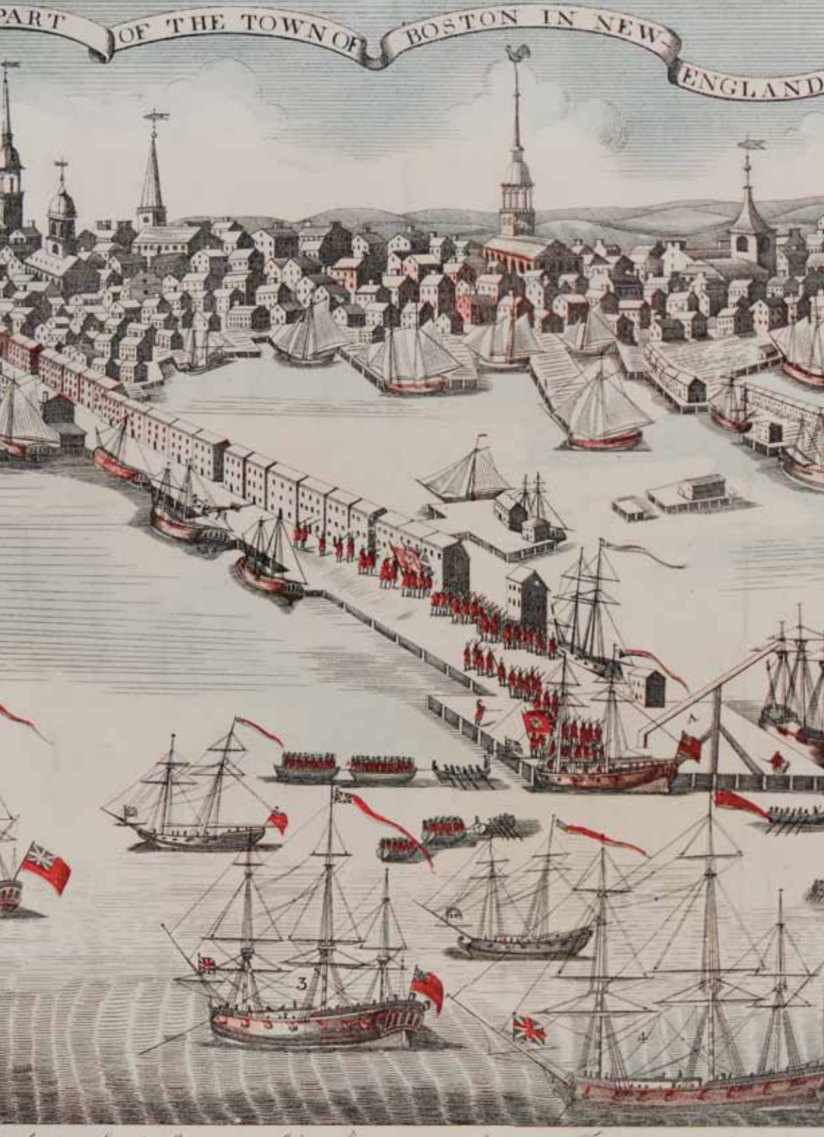
In fryday Sept' 30" 1768. the Ships of Wax, armed Schooners, Transports, Se Came up to Spring on their Cables, as for a regular Siege, At noon on Saturday October the s. the nd Train of Artillery, with two prices of Cannon, landed on the Long Wharf: there daying, and Colours flying, up KING STREET. Cach Soldier having received 16 round.