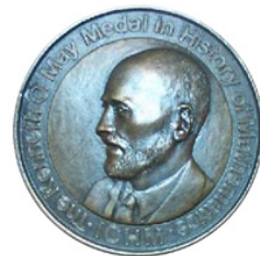
The Kenneth O. May Medal

May Medals awarded every four years in recognition of distinguished contributions to history of mathematics